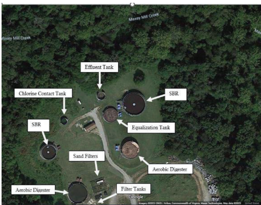
Photograph 3. Marked Aerial photograph of the Cumberland Facility's wastewater treatment plant and Maxey Mill Creek. (Source: Google Maps, modified).

17. The Cumberland Facility wastewater treatment plant, which was originally constructed in 1995 with later upgrades in approximately 2001 and 2007, included two sequencing batch reactors ("SBRs"), two digesters, a sand filter, drying beds, an equalization tank ("EQ tank") (which held greywater), an effluent holding tank, and a chlorine contact tank. See, e.g. , Photograph 3 below.