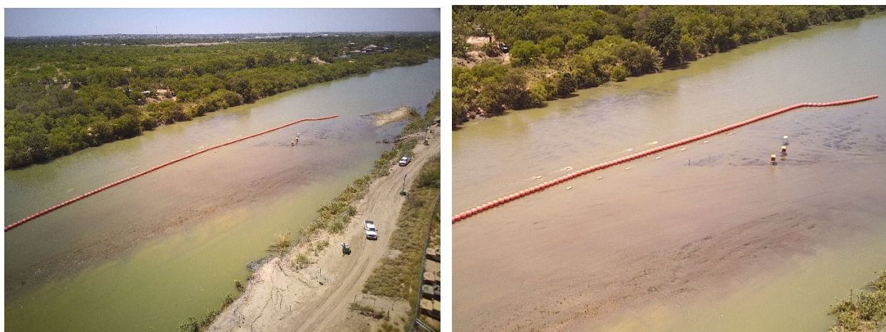
Fig. 3 – Garcia Decl. Ex. 2, full view and closeup of Floating Barrier on July 17

Texas’s construction of the Floating Barrier has already substantially harmed the United States’ foreign relations with Mexico. Quam Decl. ¶¶ 3, 13. On numerous occasions since late June, the Government of Mexico has lodged protests with the United States, including at the highest diplomatic levels, regarding Texas’s deployment of the Floating Barrier. Id. ¶¶ 8, 11. Mexico has asserted that the Floating Barrier violates various international treaties. Id. ¶ 9.