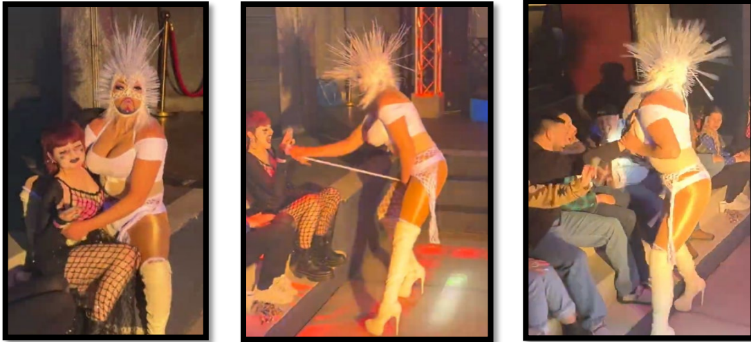
Def.'s Ex. 363