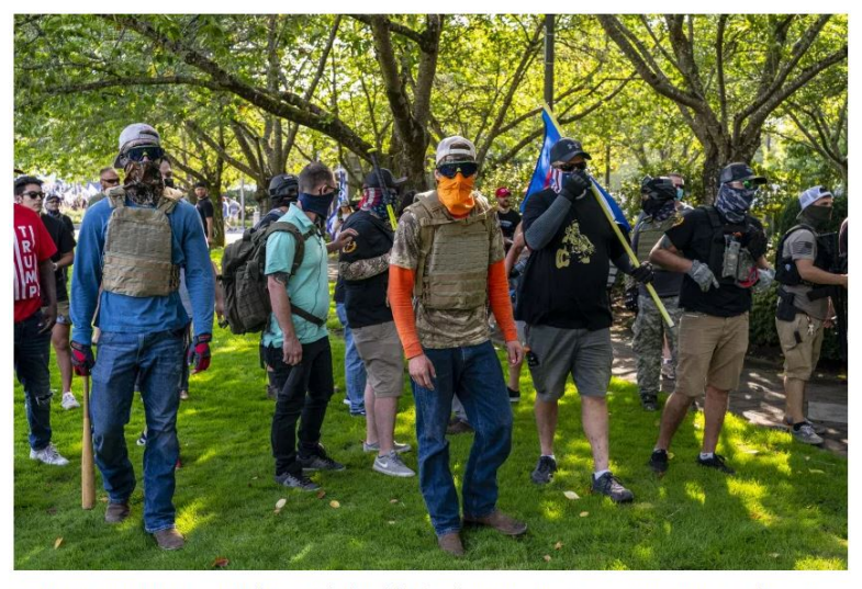
SALEM, OR – SEPTEMBER 07: Proud Boys and other right wing demonstrators pursue counter-protesters after a pro-Trump caravan rally convened at the Oregon State Capitol building on September 7, 2020 in Salem, Oregon. The caravan event, billed as the Oregon For Trump 2020 Labor Day Cruise Rally, began in Clackamas and made its way to the Oregon State Capitol in Salem.

Another image in this series (below) appears to show M. Klein wearing a blue shirt, goggles similar to those depicted above, body armor, and red and black fingerless gloves similar to those in Image 1 and elsewhere above. Close-up images of these gloves, which both have the words "Firm Grip," are also below.