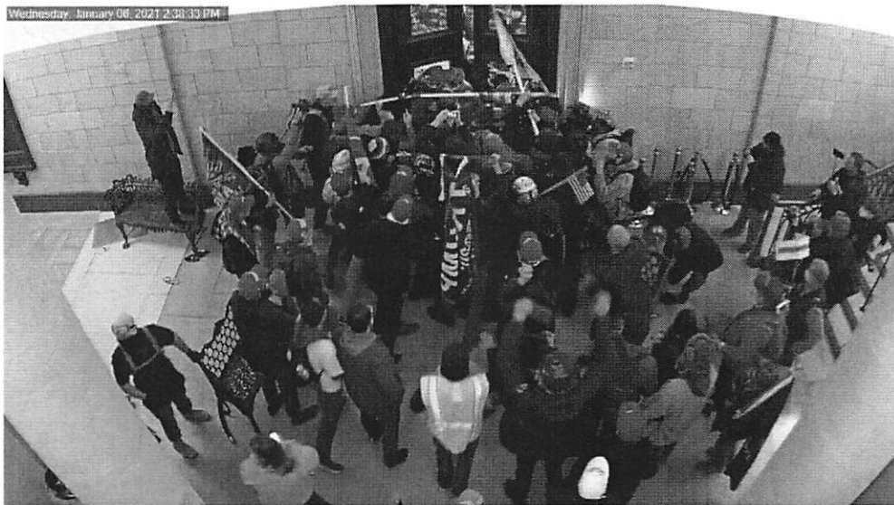
Exhibit 4 - Capitol Police CCTV screenshot

CCTV footage documented that REYES and BOGUE entered the Capitol Building less than two minutes after other rioters already inside the building had forced the doors open from the inside, as depicted below in Exhibit 4, allowing REYES, BOGUE, and others gathered outside of the door to stream in.