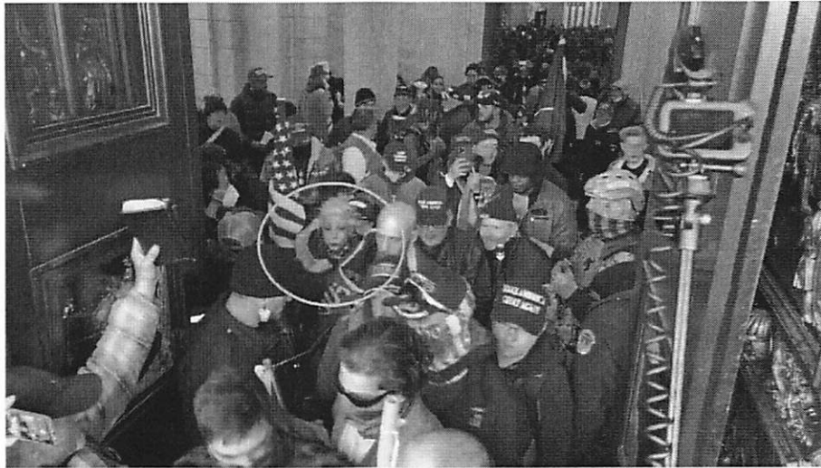
Exhibit 8 – still image from open source video located at https://archive.org/details/capital-hill-occupy-ovfr-18/Capital+Hill+Occupy+-ovfr18.mp4

Although REYES stated in her interview that officers outside of the Capitol were removing and moving barricades to let people pass, an open source video previously posted on the internet shows that during the time an individual matching REYES' distinct appearance was at the barricades at the East Front of the Capitol officers were actively trying to restrict the crowd for breaching the barricades. Notwithstanding their efforts the officers were eventually overwhelmed and overrun by the rioters. In the video, REYES appears on the front line of the protestors. The video then shows the minutes afterwards where Capitol Police are pushed back by rioters in that same area of the East Plaza of the Capitol.