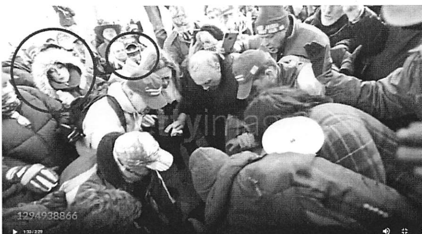
Exhibit 11 – still image of video located at https://www.gettyimages.com/detail/video/mob-of-pro-trump-rioters-and-protesters-break-into-the-u-news-footage/1294938866 at timestamp 1:30