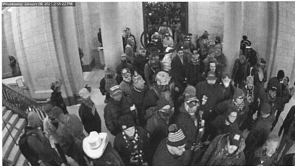
Exhibit 6 - Capitol Police CCTV screenshot

The two remained in the building until approximately 2:58 pm, when they exited together through the East Rotunda Doors, as depicted in Exhibit 7.