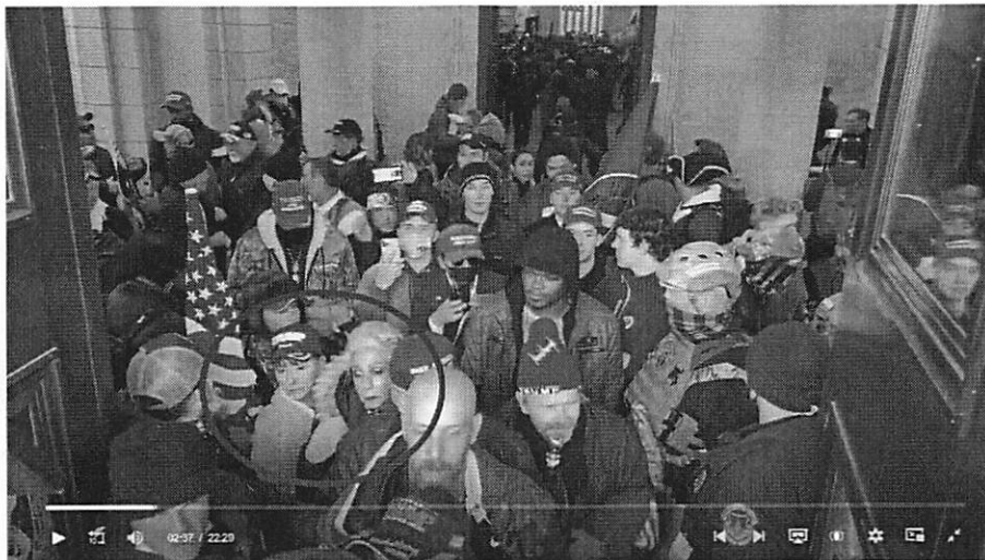
Exhibit 12 – still image from open source video located at https://archive.org/details/capital-hill-occupy-ovfr-18/Capital+Hill+Occupy+-+ovfr18.mp4 at timestamp 02:37

Although BOGUE identified REYES in the photograph from inside the Capitol, which was a still frame of a video posted on the internet, she stated to agents during her interview that she herself had not gone inside of the Capitol with REYES. Though BOGUE claimed to have not entered the Capitol, the same video from which the earlier still frame was obtained shows that an individual dressed exactly as BOGUE was that day walking with REYES as she departed the Capitol Building, consistent with numerous Capitol CCTV videos from that day.