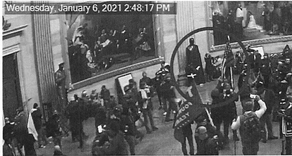
Exhibit 5 - Capitol Police CCTV screenshot