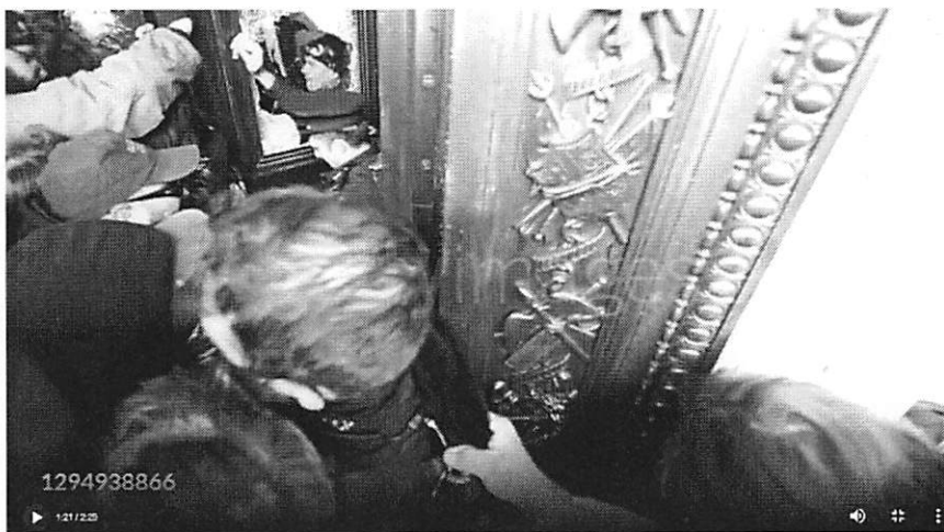
Exhibit 10 – still image of video located at https://www.gettyimages.com/detail/video/mob-of-pro-trump-rioters-and-protesters-break-into-the-u-news-footage/1294938866 at timestamp 1:21