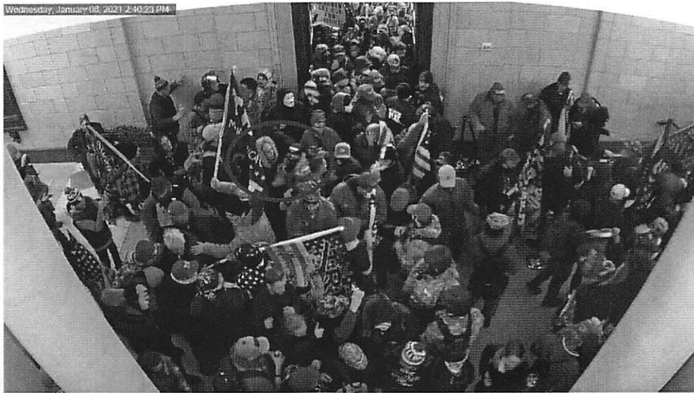
Exhibit 3 – Capitol Police CCTV screenshot

CCTV footage documented that REYES and BOGUE entered the Capitol Building less than two minutes after other rioters already inside the building had forced the doors open from the inside, as depicted below in Exhibit 4, allowing REYES, BOGUE, and others gathered outside of the door to stream in.