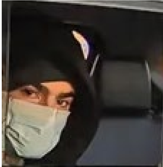
(The Shooter inside the taxi.)

WHEREFORE, I respectfully request that a warrant be issued for the arrest of LUIGI NICHOLAS MANGIONE, the defendant, and that he be imprisoned or bailed, as the case may be.