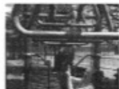
Bronx shelter helps kids escape domestic violence

If the start of the horror show seemed like a King novel, the end was more of a Quentin Tarantino flick.