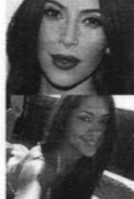
Latina Selfies That Put Kim K To Shame! (Lossip)