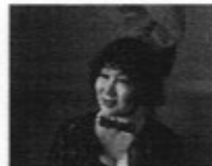
Playboy Bunnies: Then and Now (AARP)