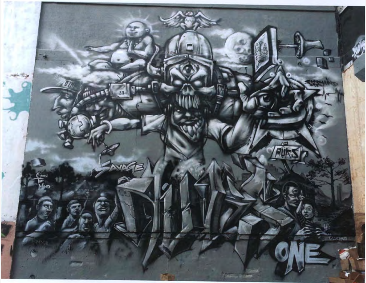
Thomas Lucero - Black Creature