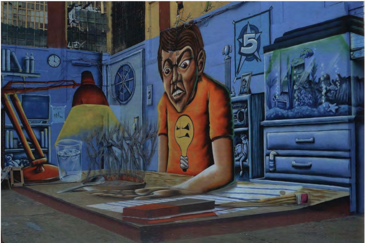
Jonathan Cohen - 7-Angle Illusion