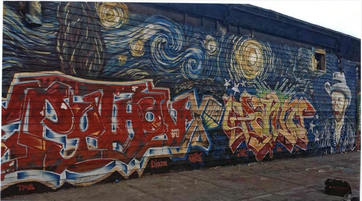
Kenji Takabayashi - Starry Night