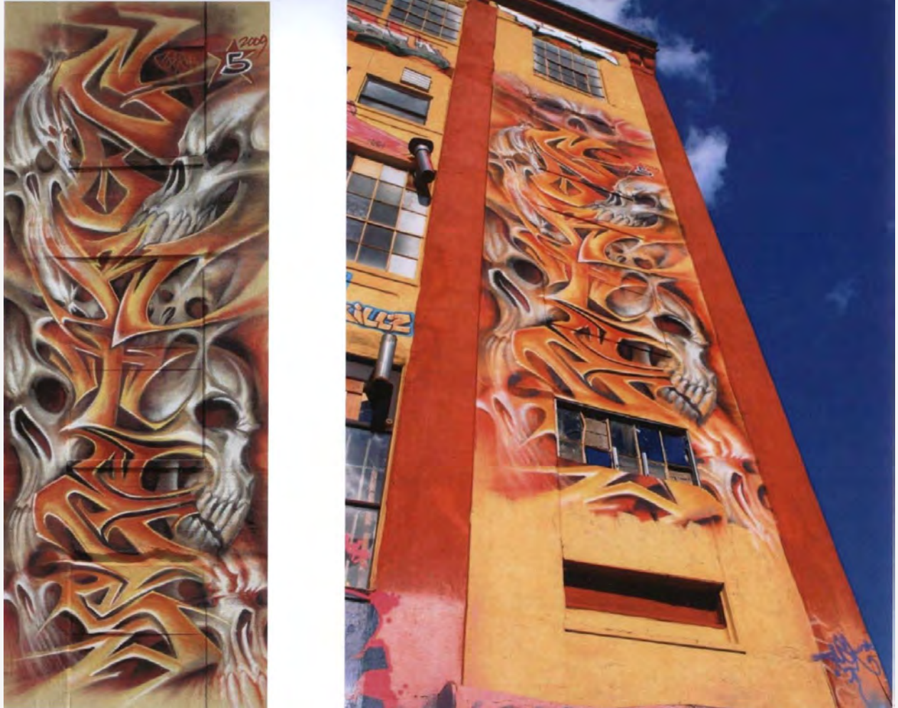
Christian Cortes - Up High Orange Skulls