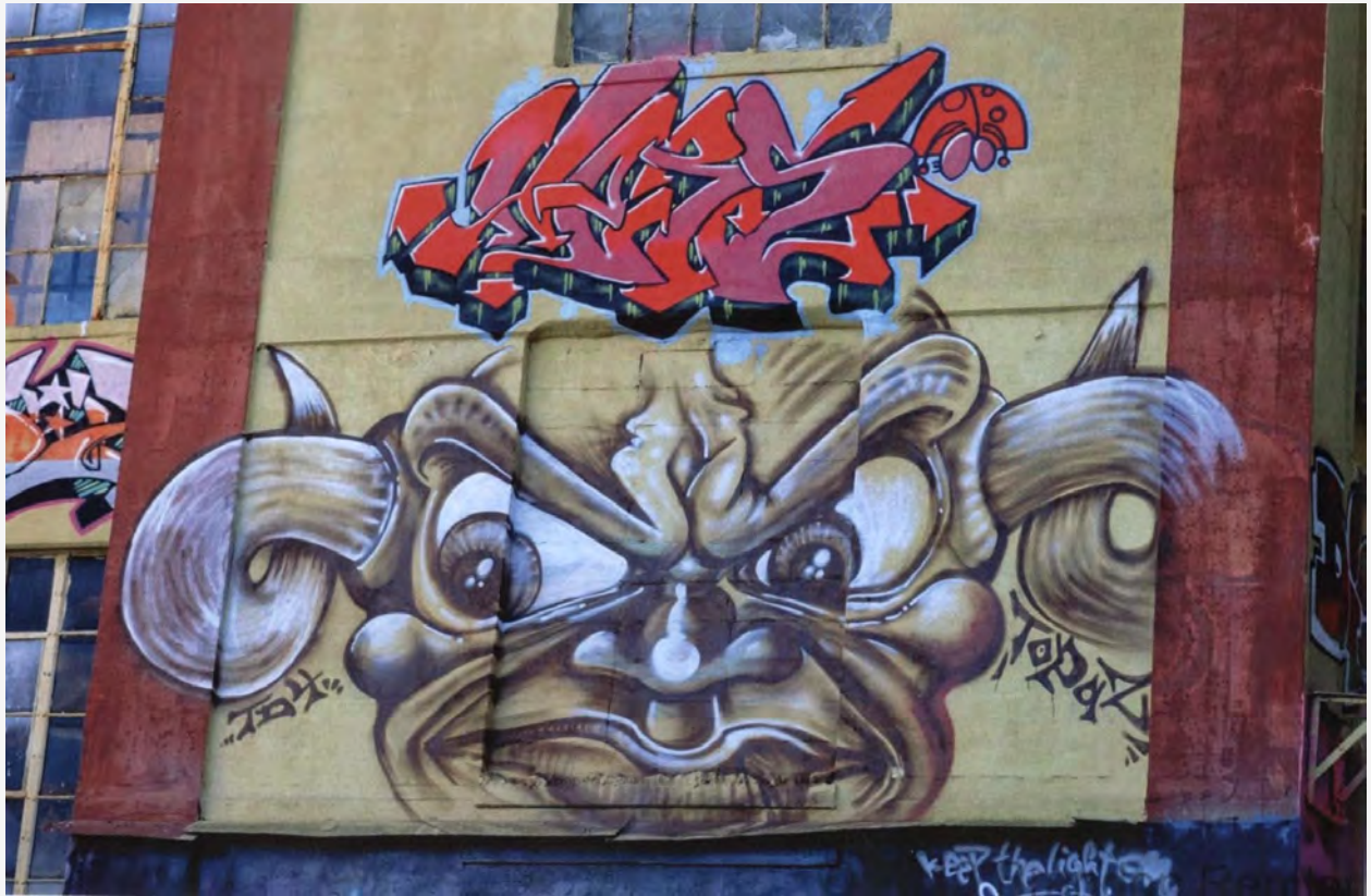
James Rocco - Bull Face