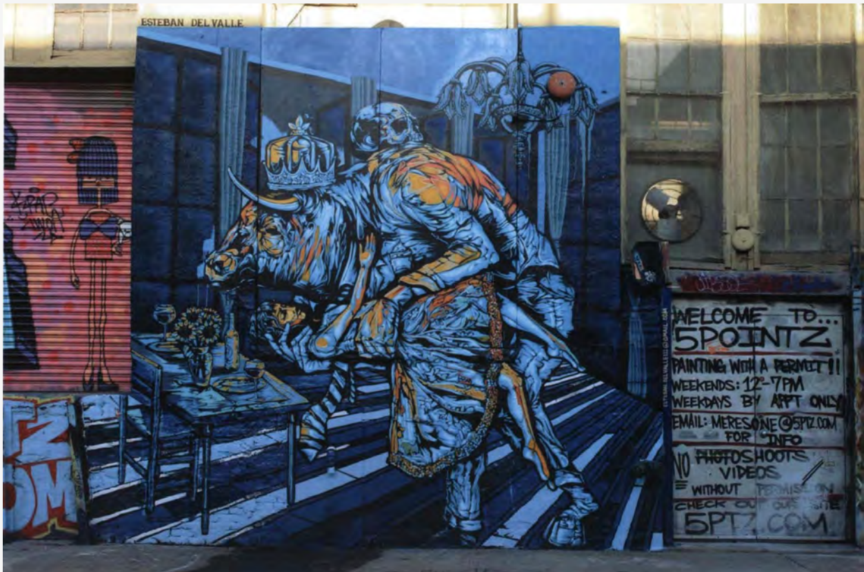
Esteban Del Valle - Beauty and the Beast