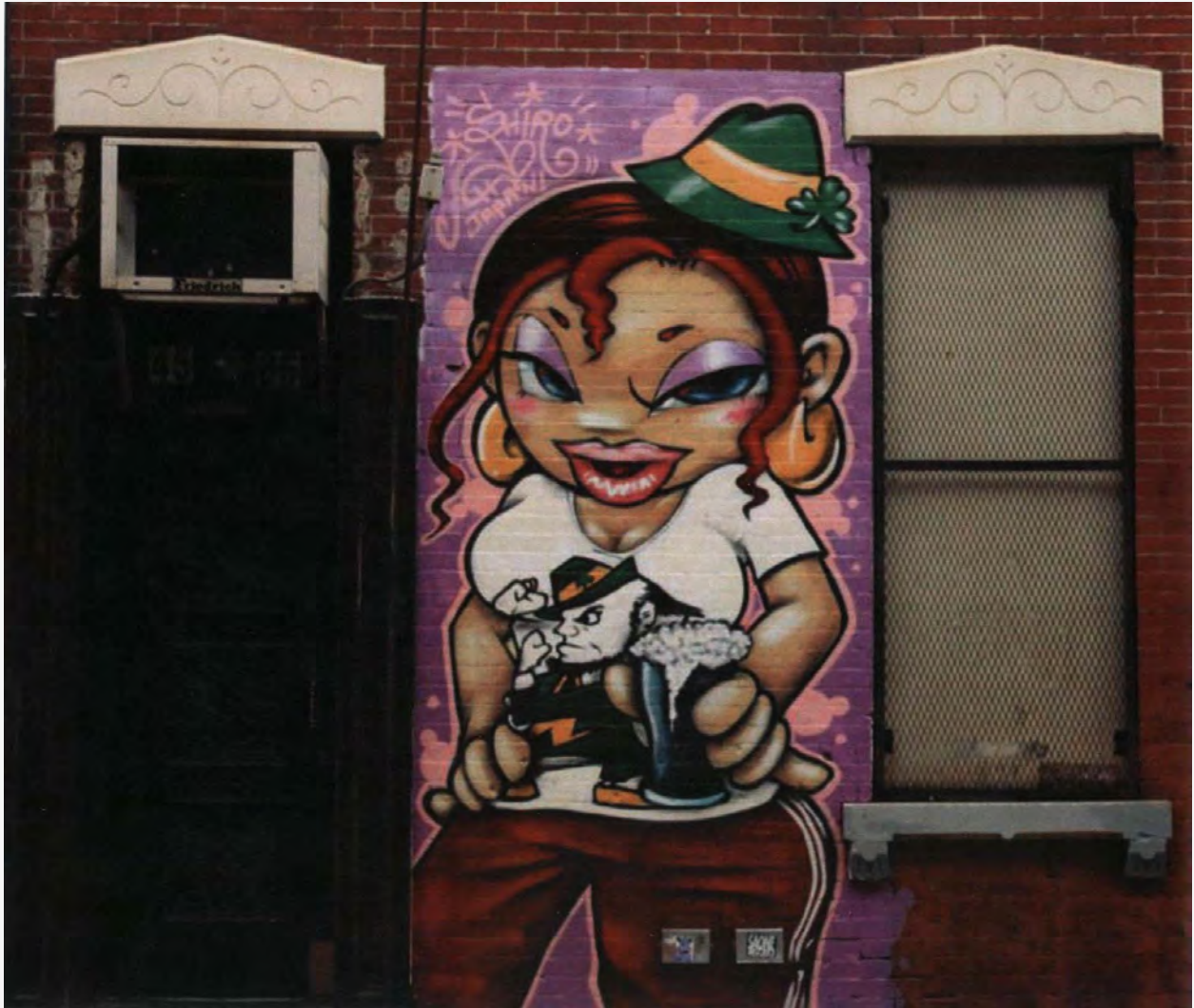
Akiko Miyakami - Japanese Irish Girl