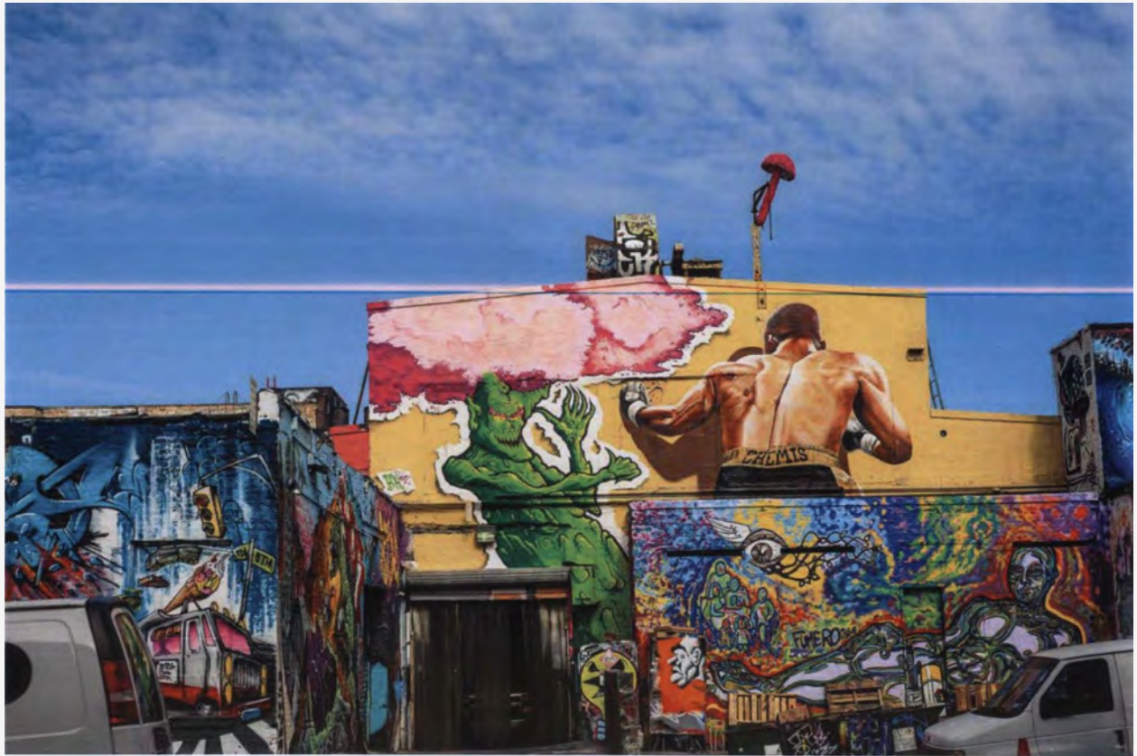
Rodrigo Henter de Rezende - Fighting Tree