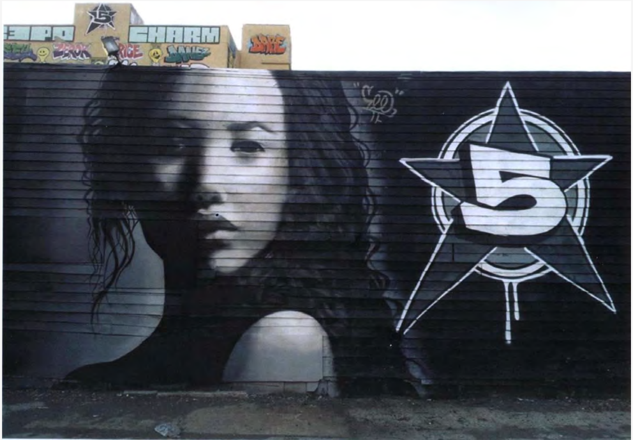
Carlos Game - Black and White 5Pointz Girl