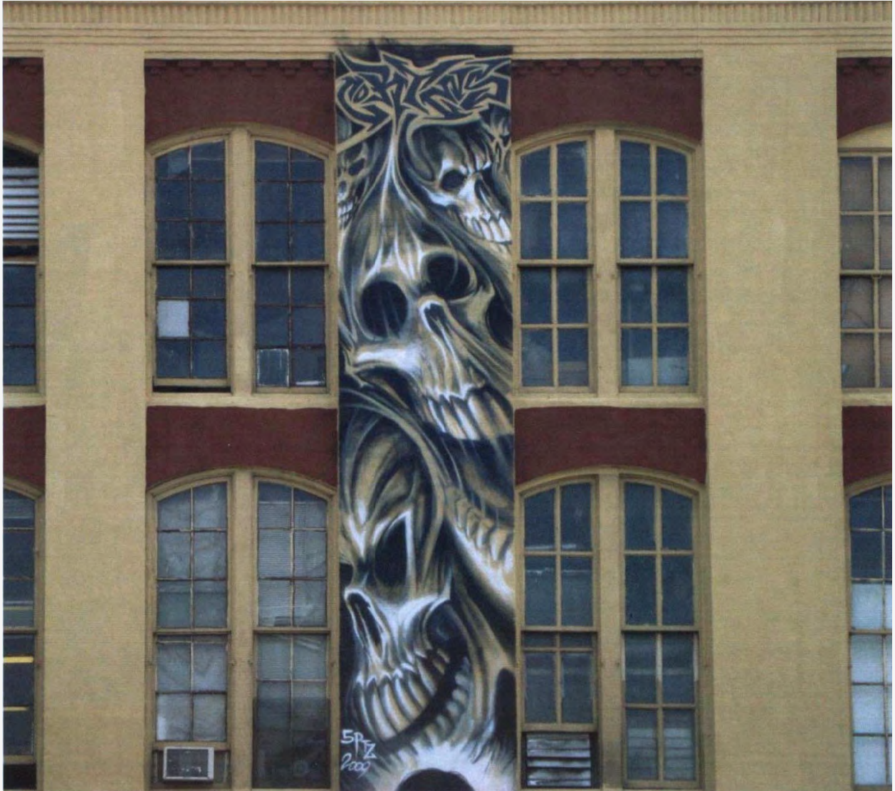
Christian Cortes - Skulls Cluster