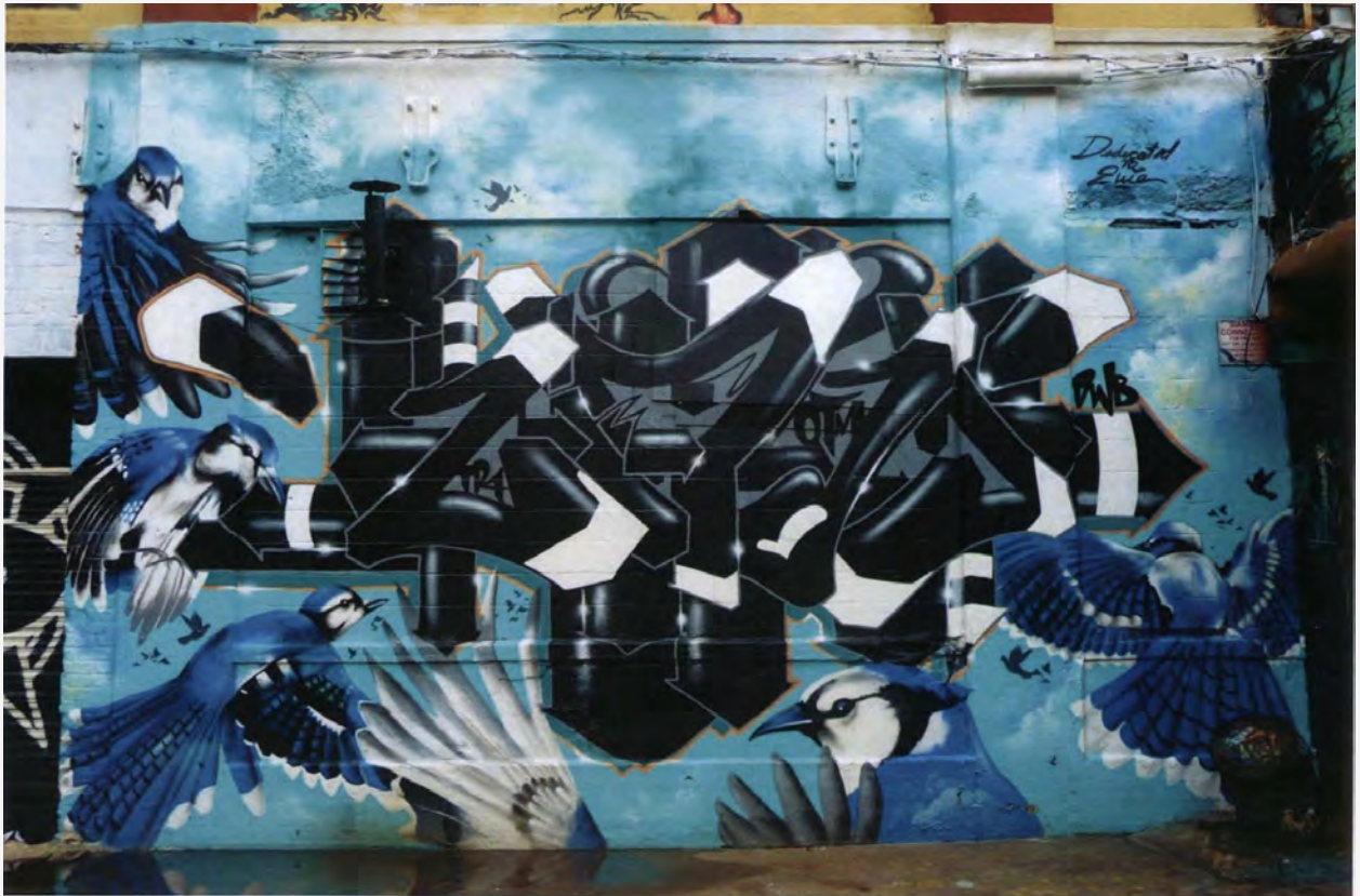
Luis Lamboy - Blue Jay Wall