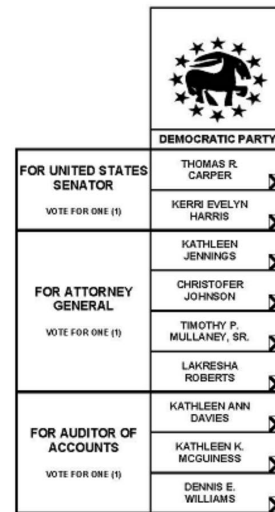
Sussex County, DE 2018 Democratic primary