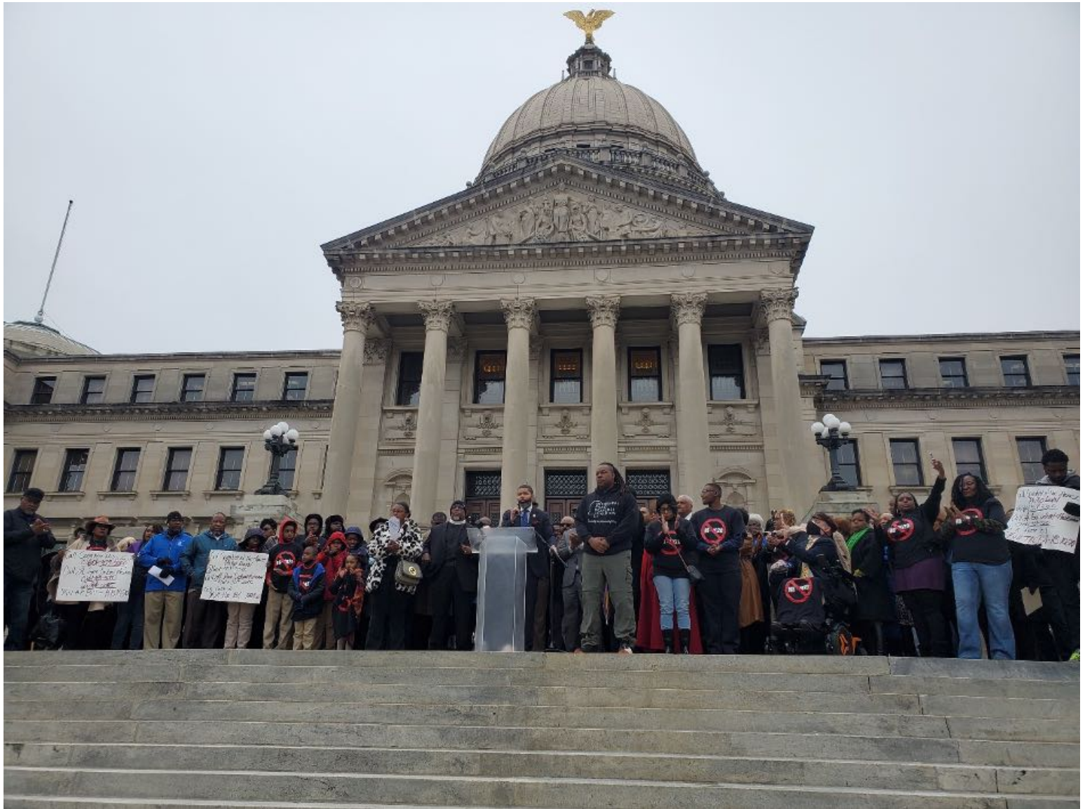
Anti-HB1020 Rally at Mississippi Capitol – City of Jackson Mayor Chokwe Antar Lumumba at podium.

Push-back from members of the community, justice and advocacy groups, lawmakers and elected officials from the City of Jackson and Hinds County rallied on the Capitol steps Tuesday, January 31 at 10 a.m. against HB 1020 – which would create a separate judicial system for the Capitol Complex Improvement District (CCID) and expand the CCID to the northeast.