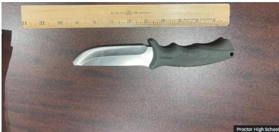
Knife used in stabbing

88. The May 23 BBC Article further stated: