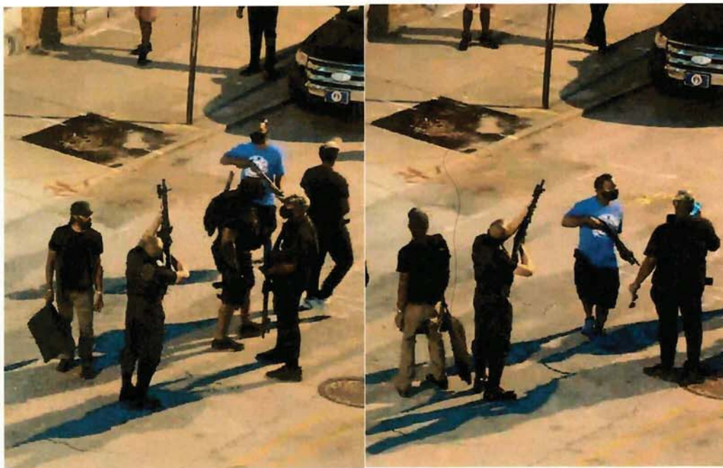
RTCC SW SS#1