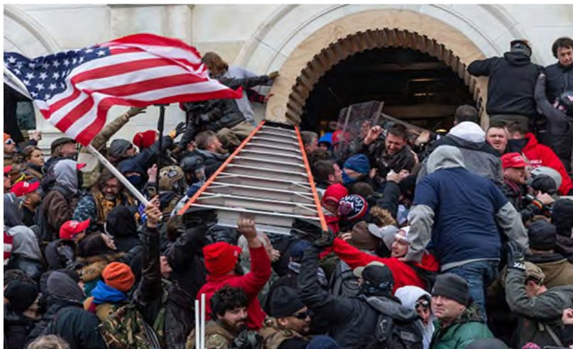
Trump's mob assaults police officers outside of the Capitol's West Terrace tunnel, Photo by Lev Raclin/Getty Images