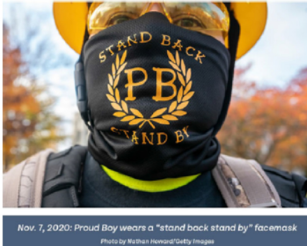
Nov. 7, 2020: Proud Boy wears a "stand back stand by" facemask

67. The Proud Boys quickly embraced Trump’s “stand back and stand by” directive as a slogan and started selling merchandise with it that same night. Jan. 6th Report at 508. Tarrío, Biggs, and two other Proud Boys leaders were later convicted of seditious conspiracy to oppose by force the lawful transfer of presidential power on January 6 th . 49