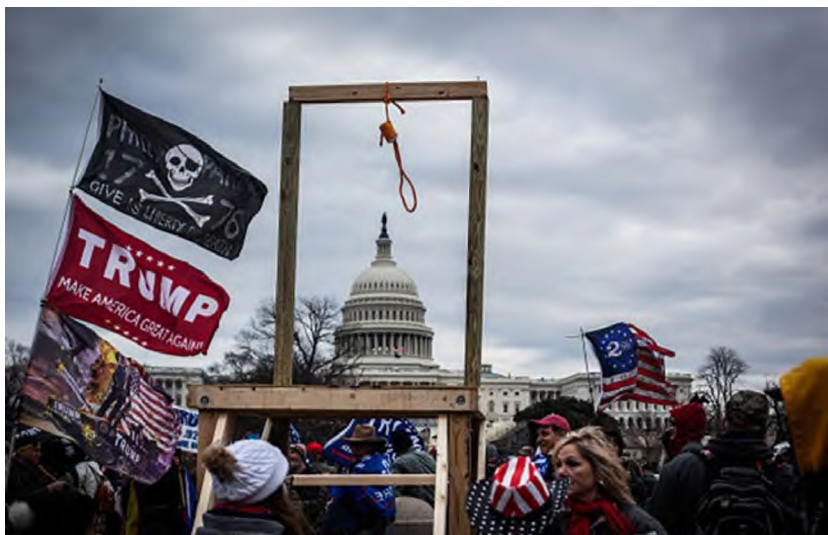
Trump's mob displays a noose and gallows on the Capitol grounds.

The mob assembled gallows on the Capitol grounds as an intimidatory display. Later, as they stormed the Capitol building, they chanted, “Hang Mike Pence!”