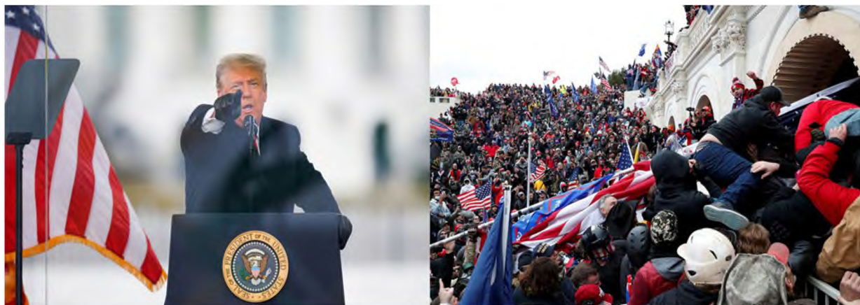
Figure 2. Trump addresses his supporters before the attack the capitol as a riotous deadly mob.

halt their constitutional duties. Their attack disrupted the peaceful transfer of presidential power for the first time in American history.