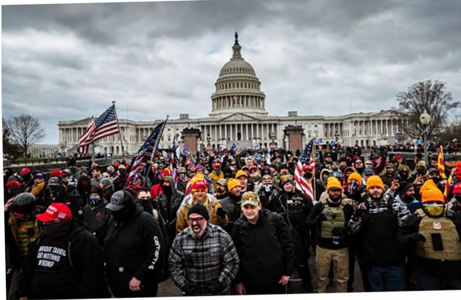
Proud Boys gather on the Capitol's East Front