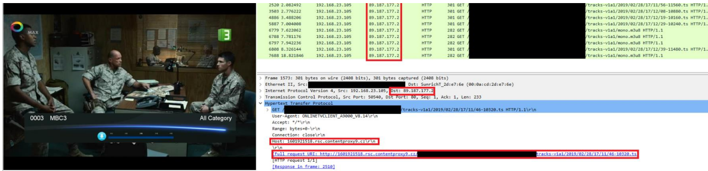
Example of Screenshot and PCAP Evidence Sent to Datacamp about the Istar Pirate Service’s Use of Datacamp’s CDN to Illegally Transmit the MBC Kids (MBC3) Channel

56. DISH and the Networks in response to Datacamp’s requests provided more information about the Pirate Services, including evidence of infringement taking place on Datacamp’s servers in the form of screenshots of transmissions of the Works and network traffic recorded in the form of PCAP files, showing that Datacamp’s servers were responsible for the infringing transmissions on the Pirate Services.