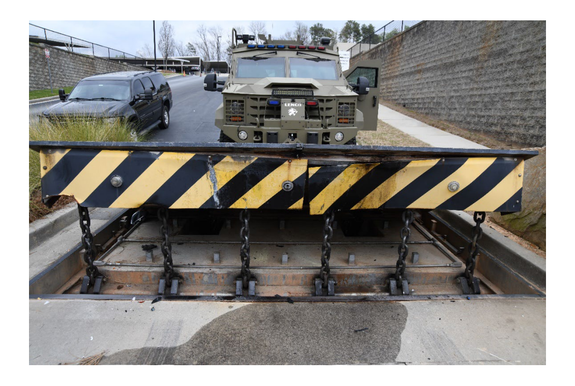
Page - 4 - of 5