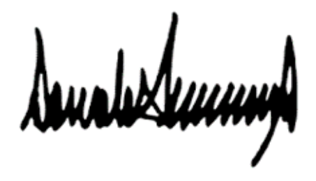
Donald J. Trump 45th President of the United States