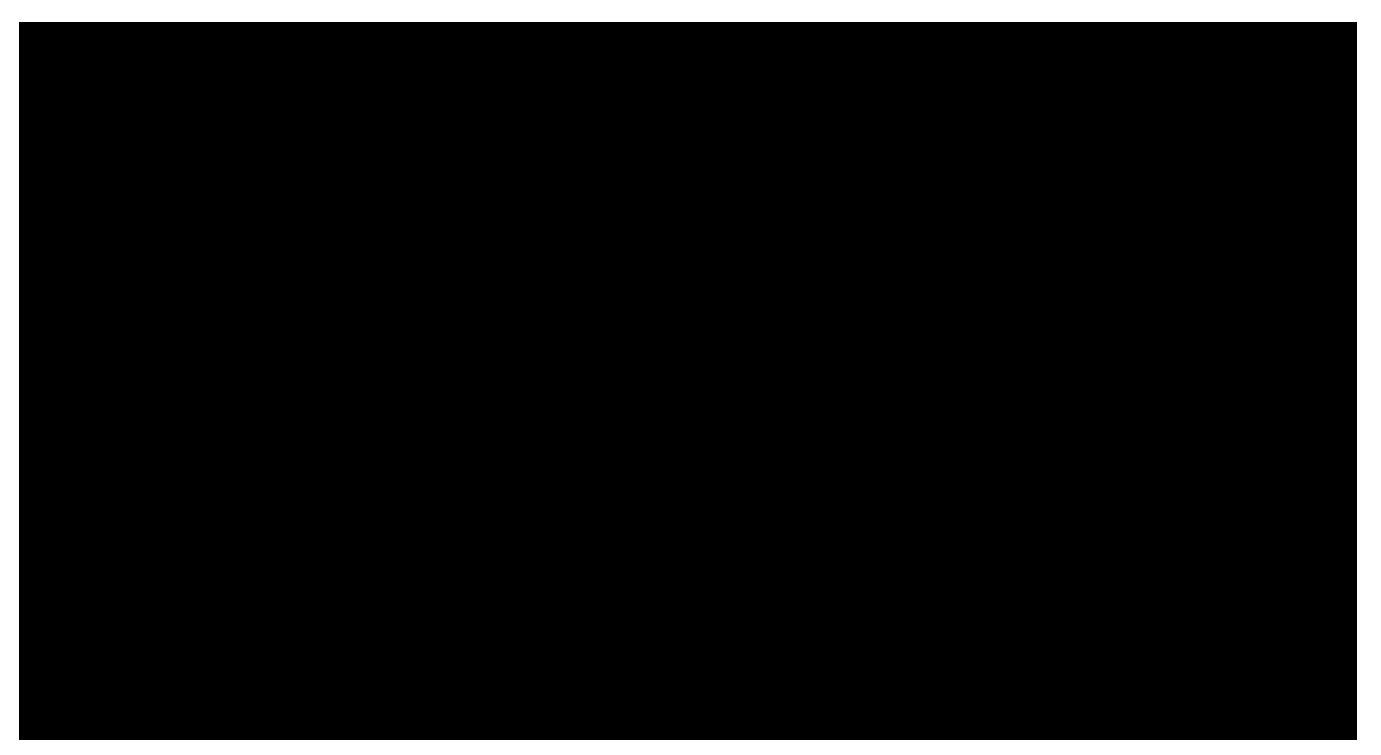
And below is a screenshot of the extraction of folder "1B18" from November of 2023: