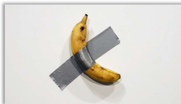
Figure 1: Comedian