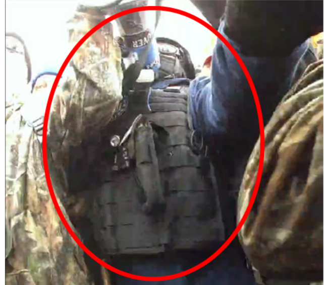
Image 10: Seconds later, WENTLAND (circled in red) grabbing Officer A.A.

WENTLAND and the mob continued to engage with this group of MPD officers. Image 11 is a still frame from an open source video that shows WENTLAND and the mob engaging with the line of police officers.