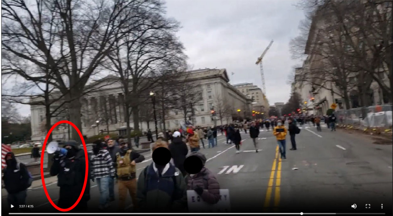
Image 6: WENTLAND (circled in red) marching with other HVPBs. Visible at https://jan6archive.com/youtube/SuRjumEQw70.mp4

In another open source video, your affiant identified WENTLAND marching in front of a row of assembled law enforcement officers inside the restricted perimeter of the Capitol on January 6, 2021. Using a bullhorn, WENTLAND stated to police line, “Where’s your fucking oath?”; “Your values mean nothing”; and “We used to back the blue, but now you’re Oathbreakers and we can’t stand you”.