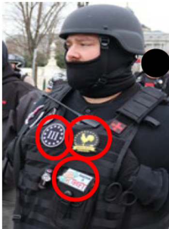
Image #1: FBI Photograph #274 – with yellow Proud Boys, black Three-Percenter, and “Taxation is Theft” patches (circled in red)

In the aftermath of January 6, 2021, the FBI issued a series of photographs attempting to identify individuals that may have committed federal violations in the vicinity of the United States Capitol Building on January 6, 2021. The individual in photograph #274 is wearing a black helmet, complete with a black vest with patches, consistent with the patches observed on the individual circled in red from Image #1.