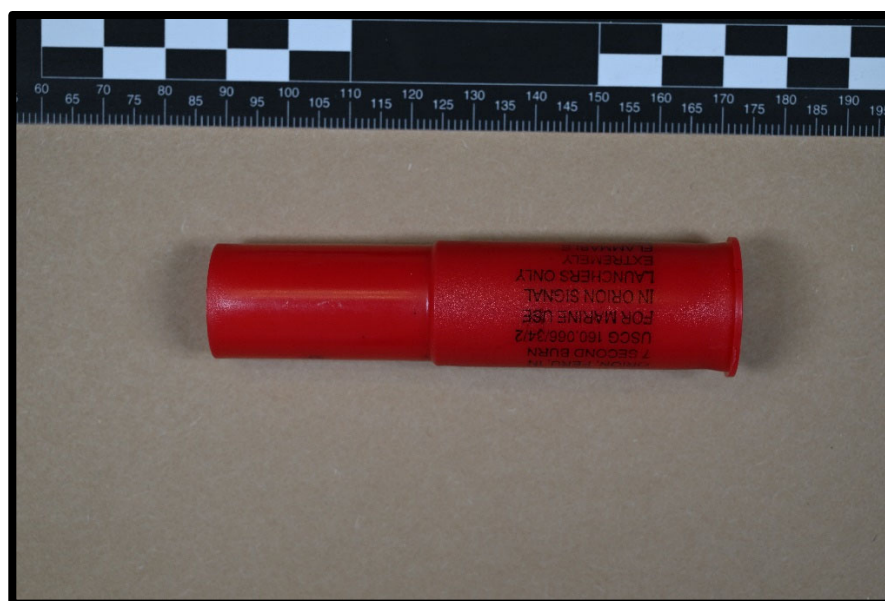
Figure 2. Flare round found in Olson's Jacket