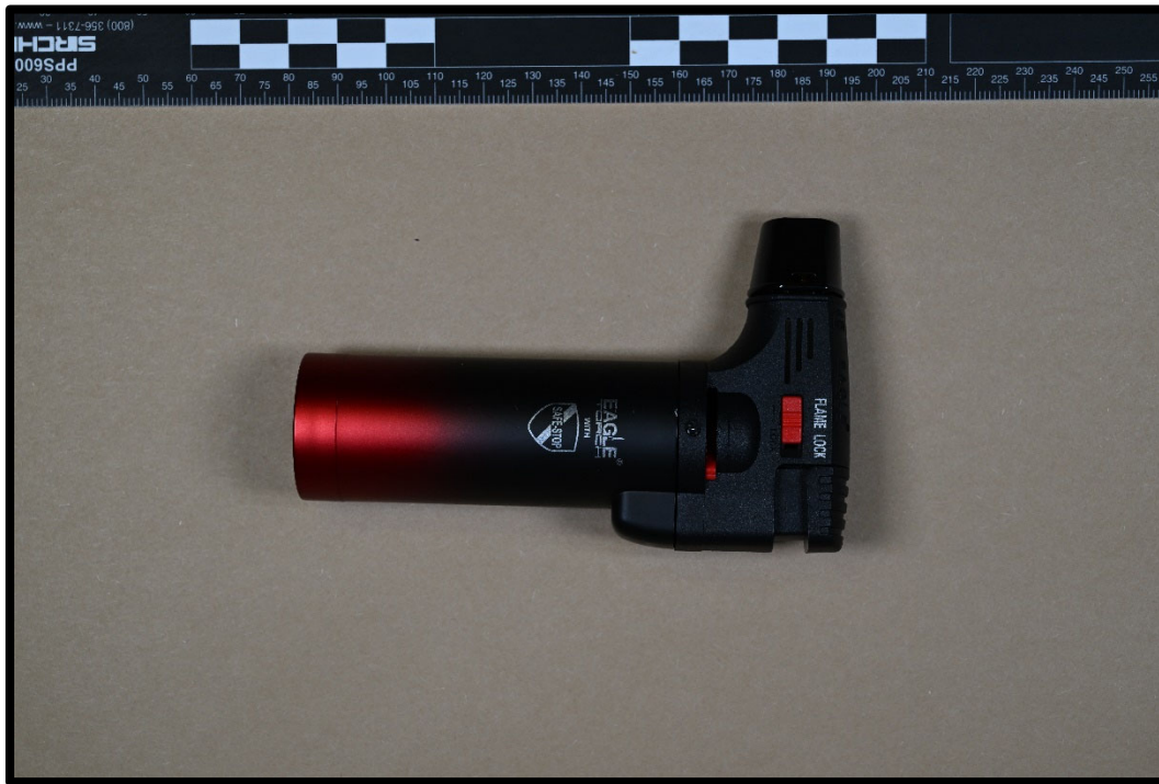
Figure 3. Flame Torch Found in Olson's Jacket

Officer G.C. showed the contents to fellow officers in the vicinity and asked OLSON to walk through the magnetometer where another officer confirmed OLSON had no additional items of contraband. Officers continued to screen the contents of the bookbag and detected a strong odor consistent with gasoline emitting from the book bag.