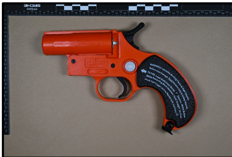
Figure 1. Flare Gun found in Olson's Jacket