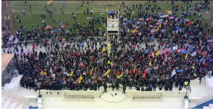
Image 8: Screenshot of Capitol surveillance footage showing the West Front flooded with rioters

As officers attempted to fend off the crowd, BARRETT can be seen climbing over a short wall, retrieving a blue “Trump 2020” flag, assisting other rioters over the wall, and making his way closer to the line of police officers.