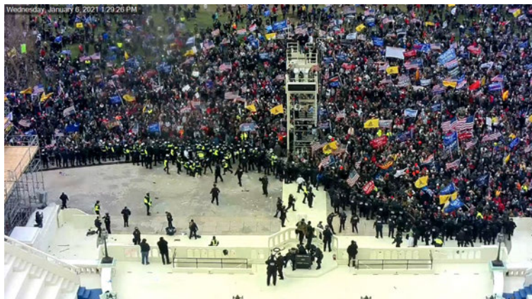
Image 12: Screenshot of Capitol surveillance footage showing the West Front flooded with rioters as officers established a bike rack line and moved the crowd back

At about 1:12 p.m., police officers from the Metropolitan Police Department arrived on the scene to assist the Capitol Police. Together, the officers formed another line of bike rack barricades and moved the crowd back.