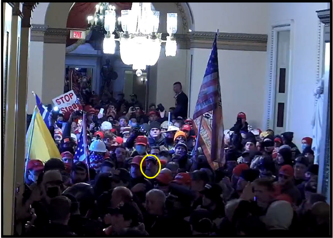
Fig. 6 – A still photo from surveillance video of BIXBY (circled) amongst a mob of rioters shortly before pushing past a line of police officers near the House Chamber.

Video shows that BIXBY eventually turned around and walked back toward Statuary Hall. As BIXBY walked away, a white mist, consistent with chemical spray, was emitted into the air. Also consistent with chemical spray, BIXBY pulled the collar of his shirt up over his nose and mouth as he walked.