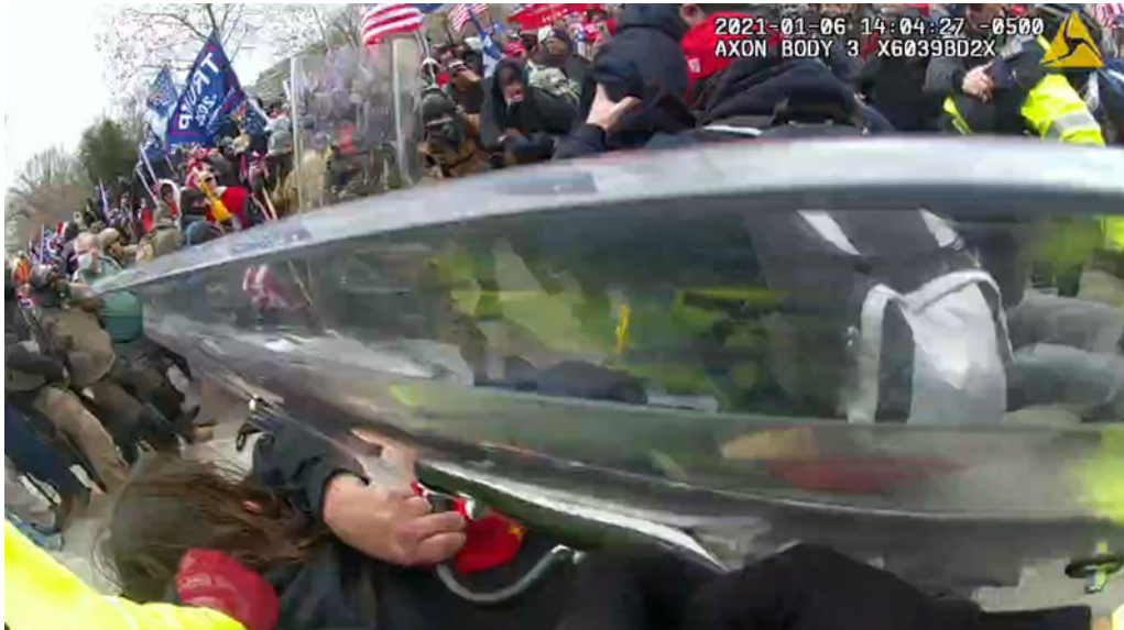
Figure 7 – BWC screenshot

surging forward toward the police line with the flag pole extended in the direction of officers. Figures 9 and 10.