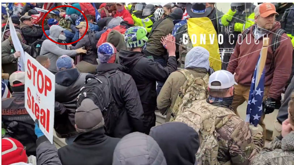
Figure 16 - screenshot of video https://archive.org/details/JmuHMaQnKrnKwgMuX