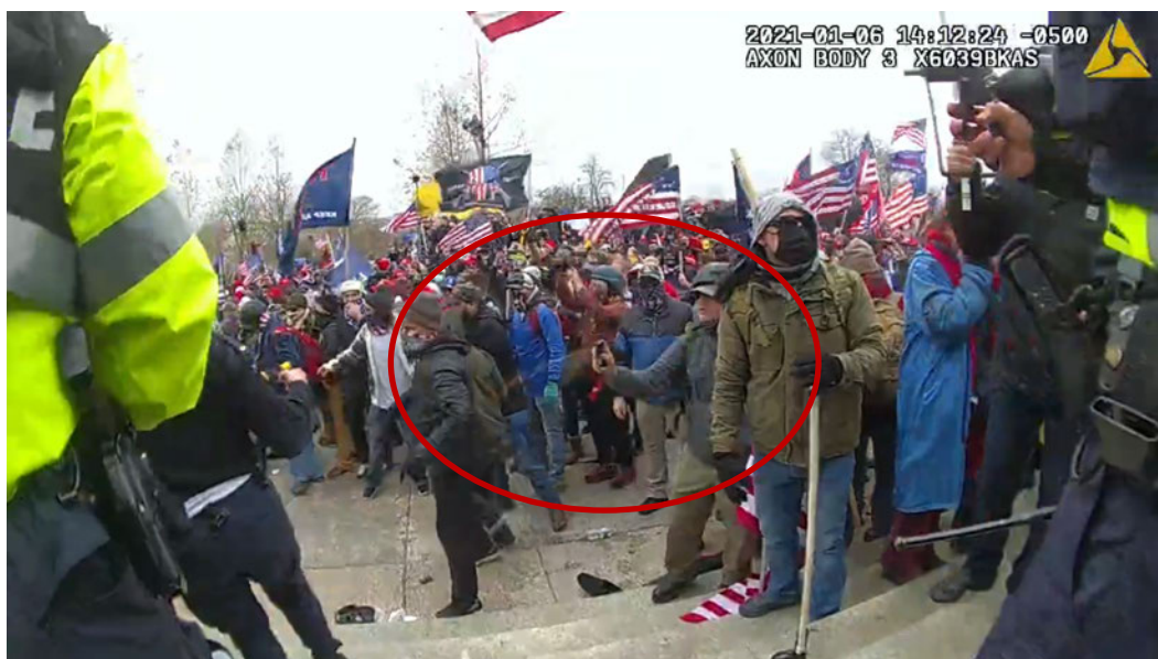
Figure 13– BWC screenshot

At approximately 2:12 pm rioters once again surged up the stairs in the same area and attacked officers, pulling some of them down the steps. Other officers then advanced down the steps to protect and retrieve the others, at which time from the side of the crowd of rioters AMOS pulled the cannister out of his pocket and sprayed it at the officers. Figure 13.