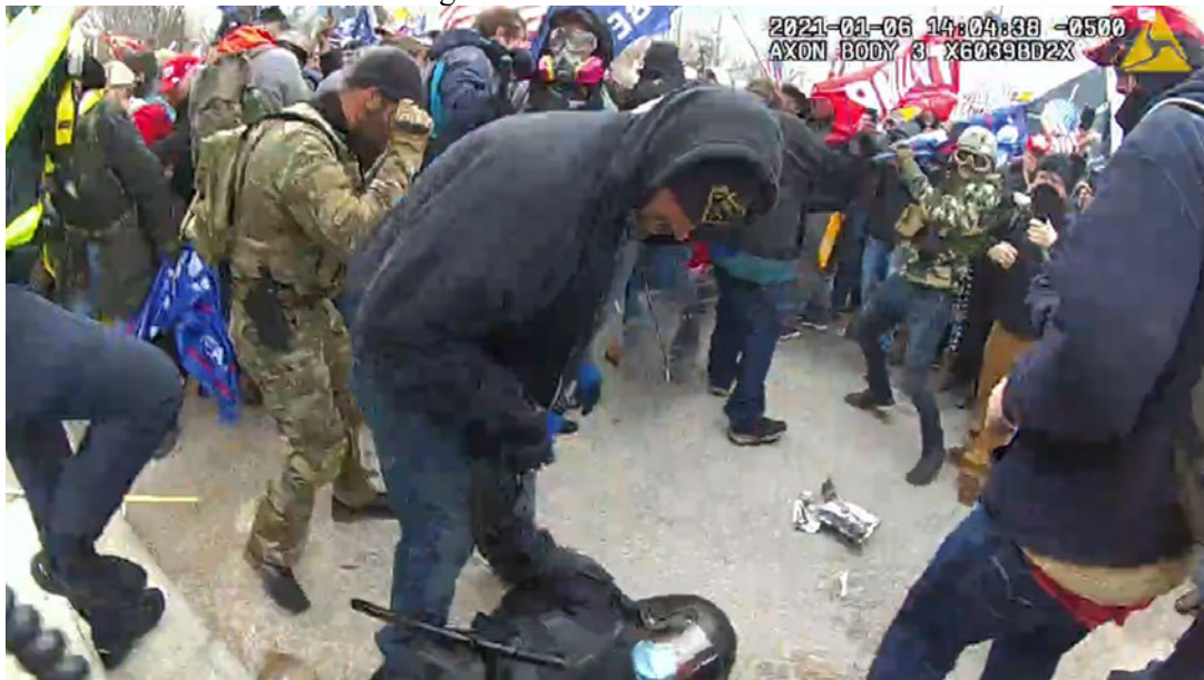
Figure 8– BWC screenshot