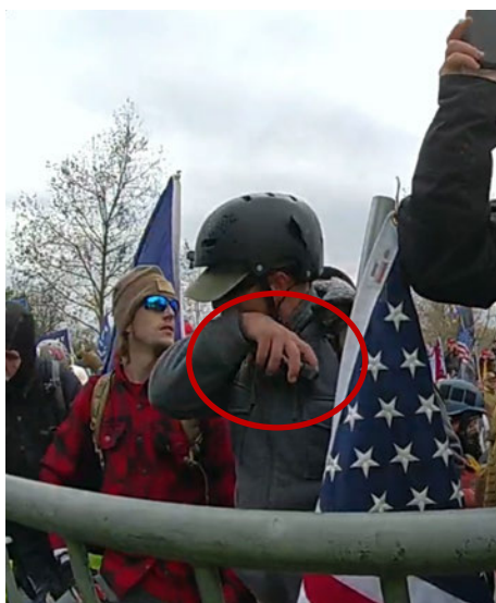
Figure 11–BWC screenshot