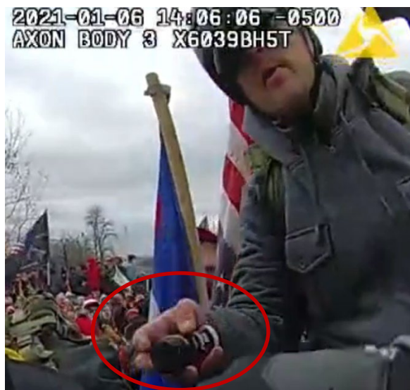
Figure 12-BWC screenshot

At approximately 2:12 pm rioters once again surged up the stairs in the same area and attacked officers, pulling some of them down the steps. Other officers then advanced down the steps to protect and retrieve the others, at which time from the side of the crowd of rioters AMOS pulled the cannister out of his pocket and sprayed it at the officers. Figure 13.