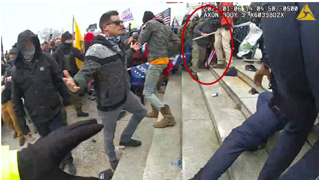
Figure 9– BWC screenshot