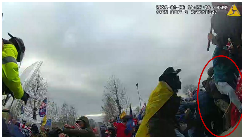
Figure 17- screenshot of BWC

Based on the foregoing, your affiant submits there is probable cause to believe that AMOS committed a felony violation of Title 18, U.S.C. § 111(a)(1), which makes it unlawful to forcibly assault, resist, oppose, intimidate, or interfere with any person or persons while engaged in or on account of the performance of official duties. For purposes of Section 111(a)(1), the person or persons in this instance were Metropolitan Police Department (MPD) and United States Capitol Police Officers responding to the siege of the United States Capitol. Through my investigation, I know that MPD officers at the Capitol on January 6 th were present specifically to assist federal law enforcement in their efforts to protect the Capitol and the people inside, and were assisting federal officers in the performance of their official duties as defined in 18 U.S.C. § 1114.