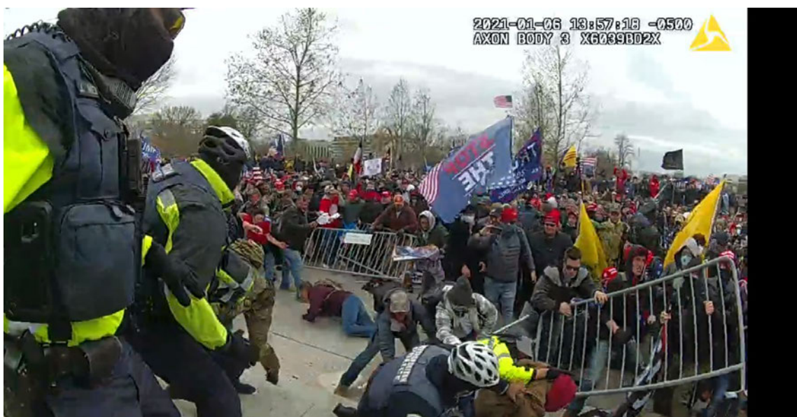
Figure 6 – BWC screenshot

At about 1:57 p.m. just to the side of where AMOS was standing a group of rioters began to pull some of the the metal fencing down and pulled officers to the ground. Figure 6. After considerable effort officers were able to re-group and re-establish the line, though some of the metal fence sections were lost to the crowd.