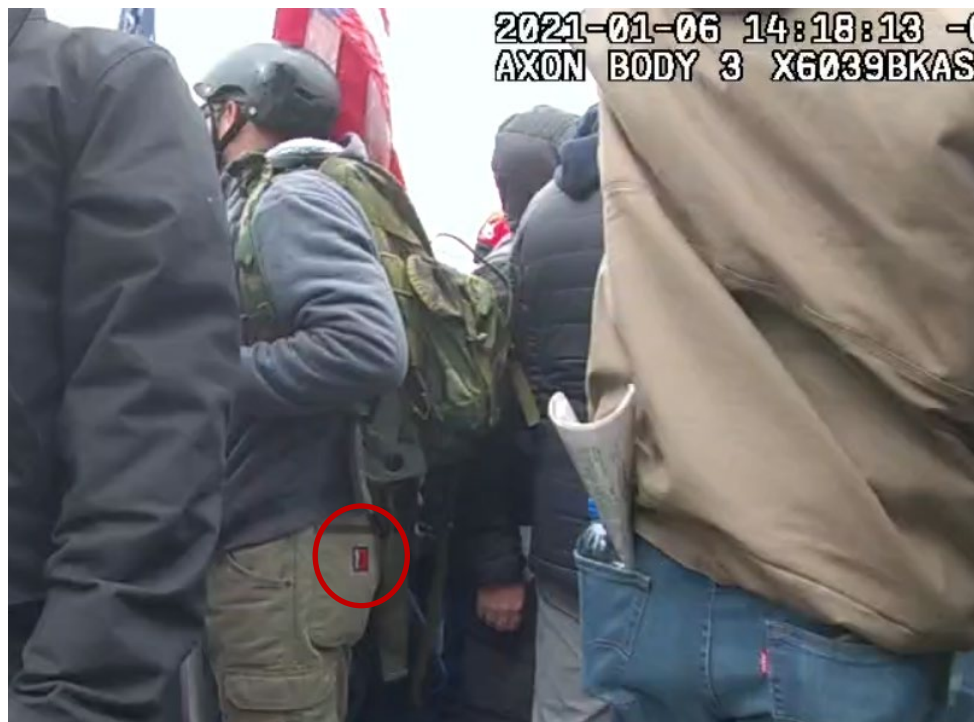
Figure 5– BWC screenshot

This same distinct logo matches the logo from the left rear pocket of the tan pants worn by him earlier in the day at the Southwest Plaza and captured on BWC. Figure 5.