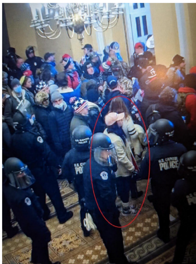
Image 6: Video Still of NOHLE Inside the U.S. Capitol Building near the Senate Wing Doors