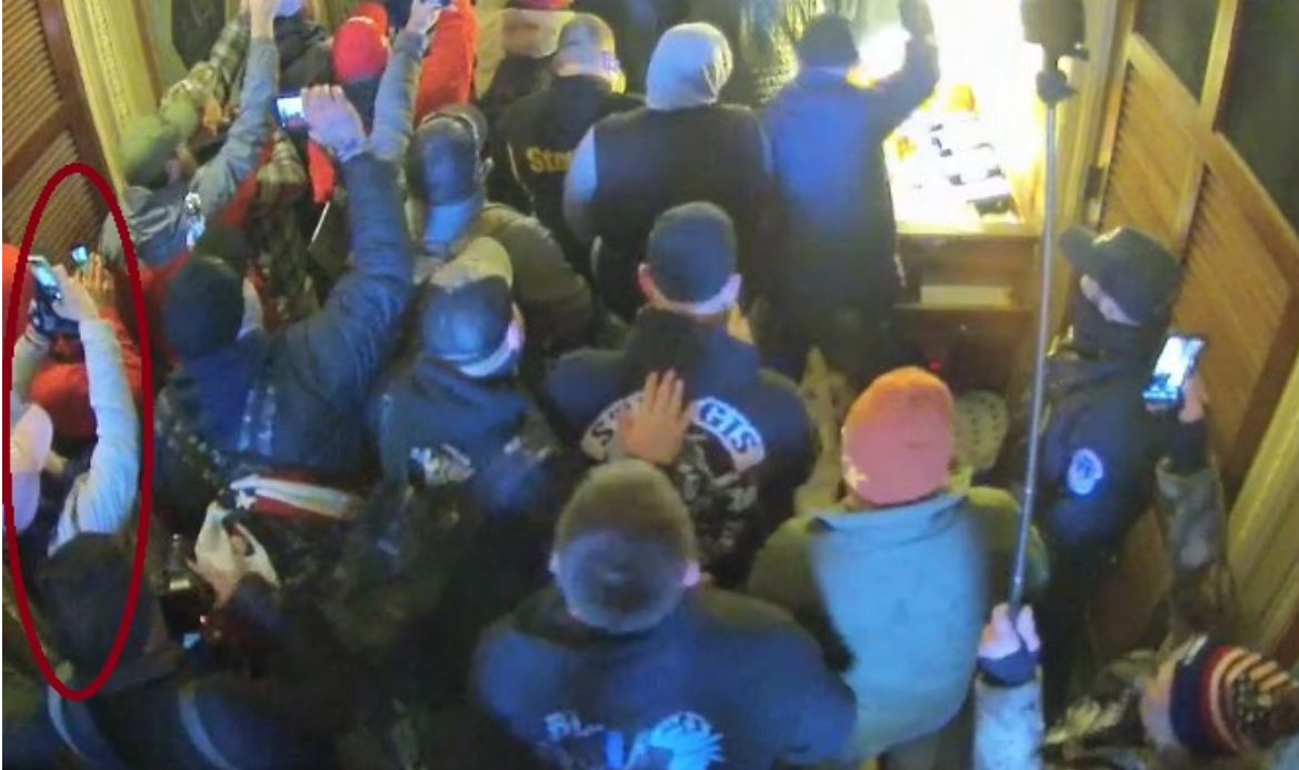
Image 4: CCTV Video Still of NOHLE Taking Photographs of the Brumidi Corridor Just inside the North Doors of the U.S. Capitol Building

NOHLE remained in the vicinity of the the Brumidi Corridor for approximately one minute before exiting through the North Doors.