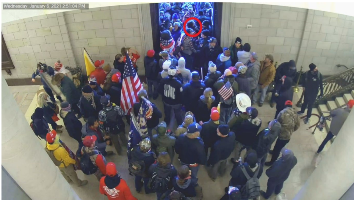
Image 11: Screenshot of Capitol CCTV footage, with KOHLER circled in red

KOHLER then left the rotunda and proceeded to exit the Capitol building through the East Rotunda Doors at 2:51 p.m.