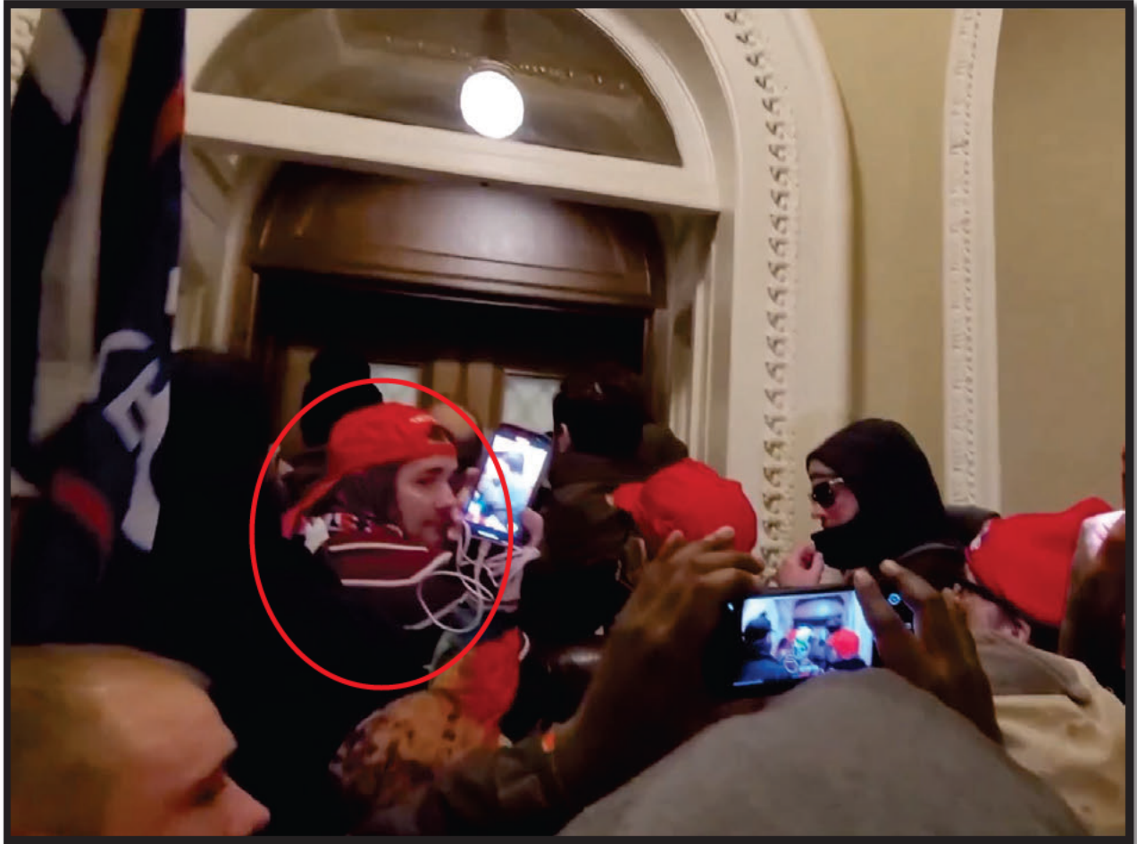
Fig. 5 – Still photo of open source video showing QUINTERNET at the entrance to the House Chamber.

At approximately 2:55 p.m., QUINTERNET walked down the House Wing Hallway, toward the Hall of Columns where he was directed by law enforcement out of the Capitol Building via the South Doors.