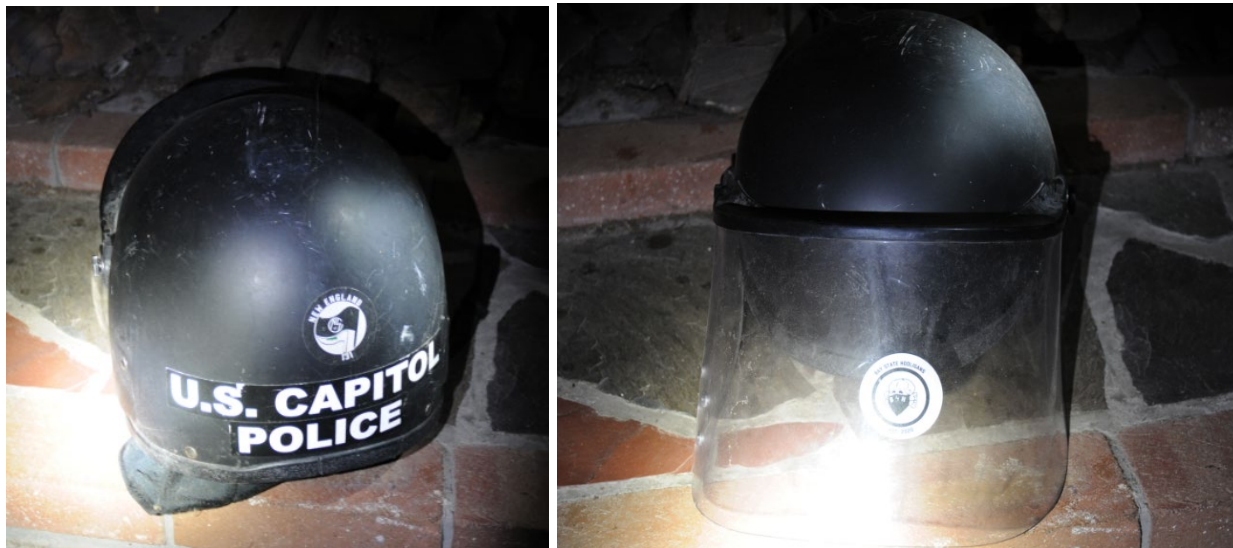
Images 3 and 4: Photographs of the front and back of the helmet recovered from Ackerman's bedroom

bedroom, located the fireplace, and found a U.S. Capitol Police helmet tucked inside the chimney flue.