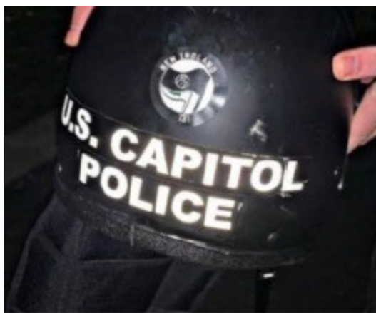
Image 1: Image from the online tip of what appears to be a Capitol Police Helmet with a New England 131 sticker affixed to it

On or about January 8, 2021, the FBI received an online tip that included a picture of what was believed to be a U.S. Capitol Police helmet defaced with a sticker affixed to the helmet. The helmet is black with U.S. Capitol Police lettering in white on the back side of the helmet. A small circular sticker with the words “New England 131” along with a black flag appears to have been placed on the helmet above the lettering: