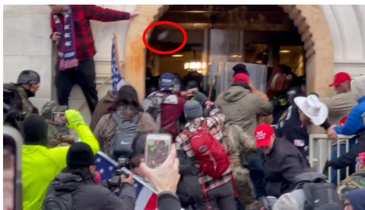
Image 12: Screenshot from the 410pm.mp4 video with a water bottle (circled in red) before hitting the Archway.

At this moment, the 410pm.mp4 video, shows a water bottle being thrown into the Tunnel, first hitting the Archway and then hitting an officer: