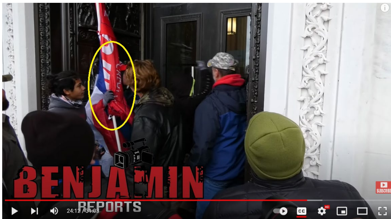
Image 5: TEDESCO observed two rioters hit and crack the glass on the southeastern door.

Open-source video also shows TEDESCO outside the southeastern door by the House Chamber where he observed other rioters hit and break the glass on the door. Seconds later, TEDESCO observed two different rioters break a glass window a few yards away.