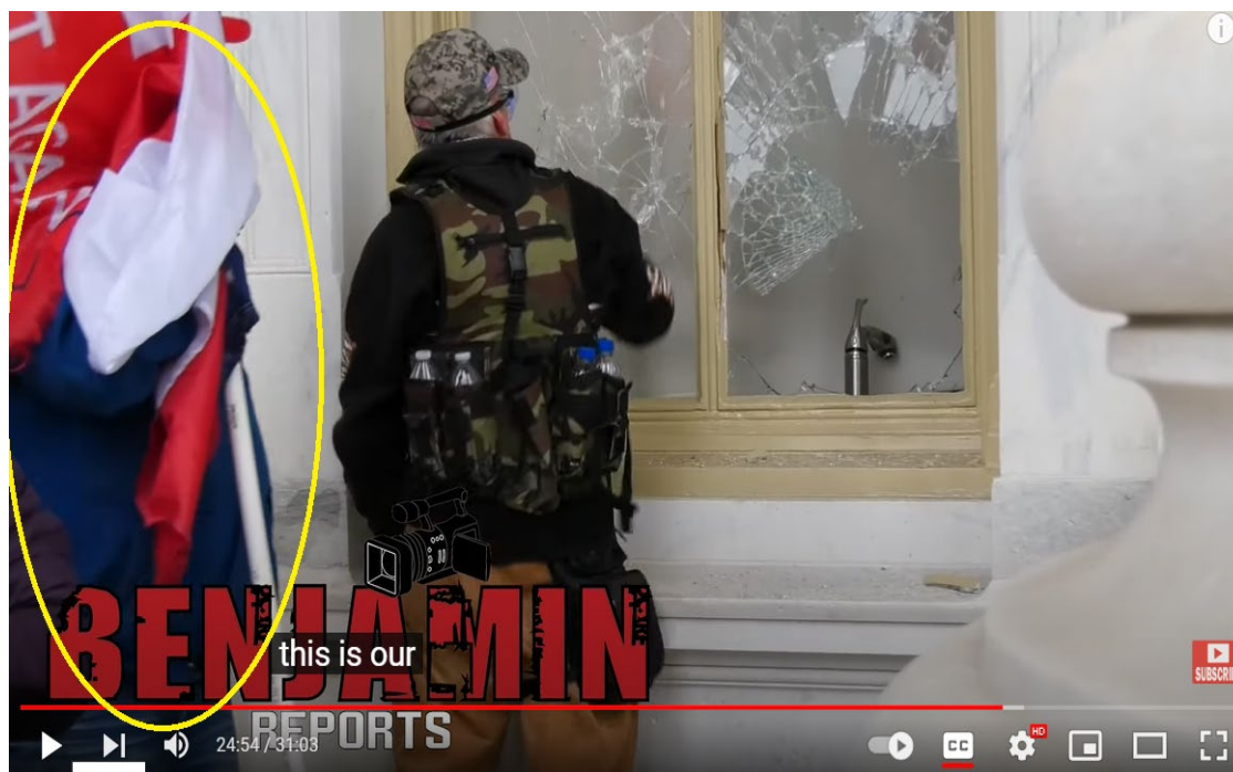
Image 6: TEDESCO observed two different rioters break the glass on a window.