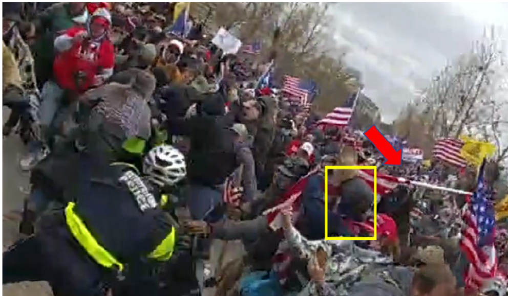
Image 11 (HOMOL's helmet indicated in yellow box; swinging flagpole indicated with red arrow)

HOMOL's assaults on police officers are visible on BWC footage from that area and time, wherein HOMOL can be seen raising his flagpole and striking two different officers. First, HOMOL struck the back of an officer wearing a gray bicycle helmet. See Images 11 and 12.