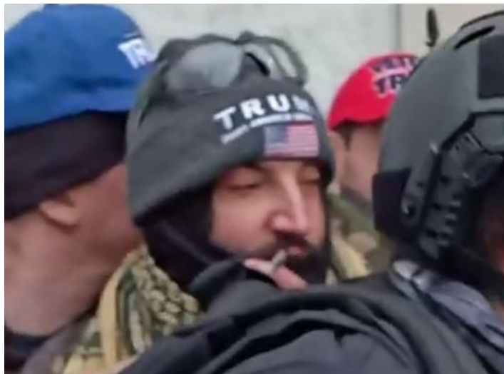
Portion of Figure 5