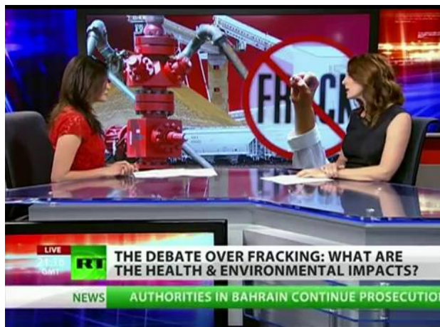
RT anti-fracking reporting (RT, 5 October)