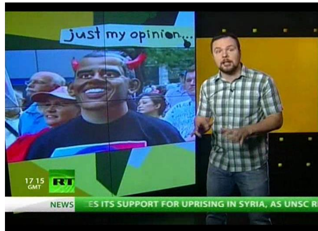
Messaging on RT prior to the US presidential election (RT, 3 November)