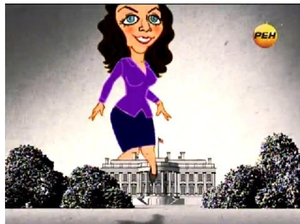
Simonyan steps over the White House in the introduction from her short-lived domestic show on REN TV (REN TV, 26 December 2011)