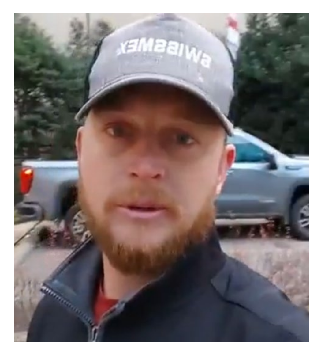
Image 3: Still from Facebook video showing WILLIAMS after leaving the U.S. Capitol grounds on January 6, 2021.

In that same video, WILLIAMS stated, "We did get into it with the cops, just a little bit." He also stated that he "took a lot of footage here, so I'll be posting some videos that I took."