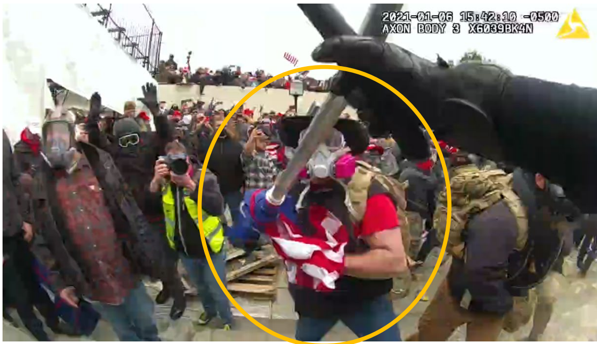
Still Image # 6