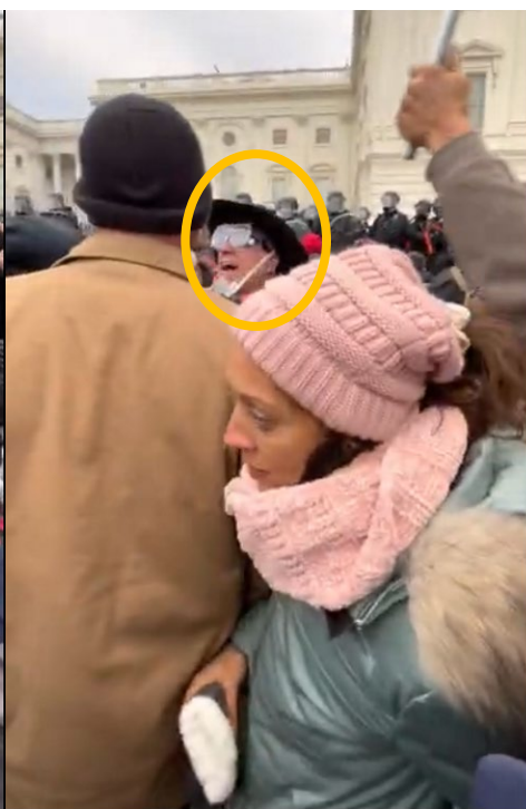
Still Image # 2