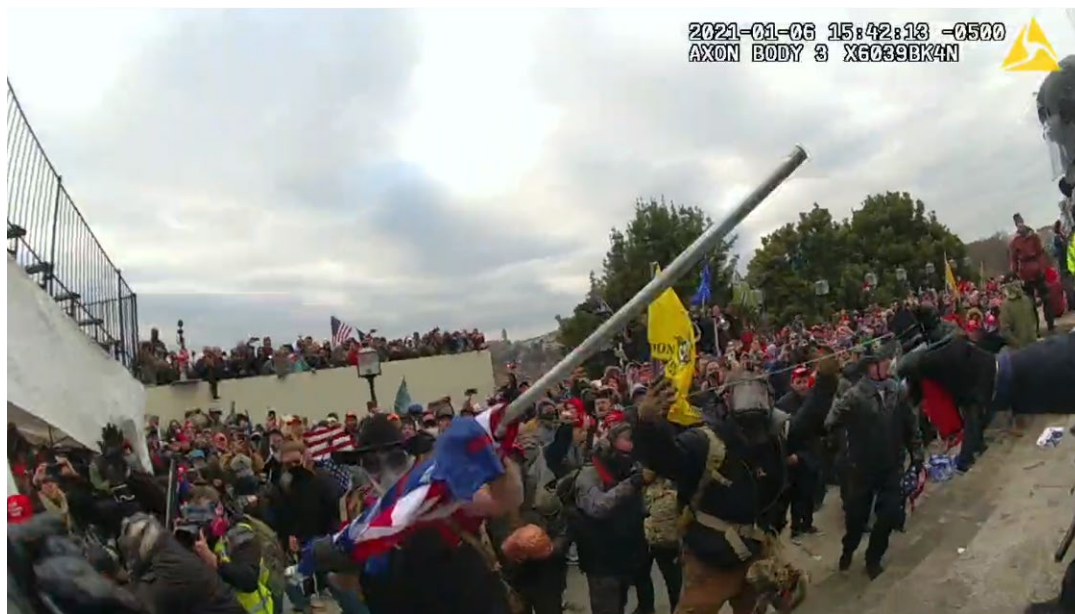
Still Image # 7