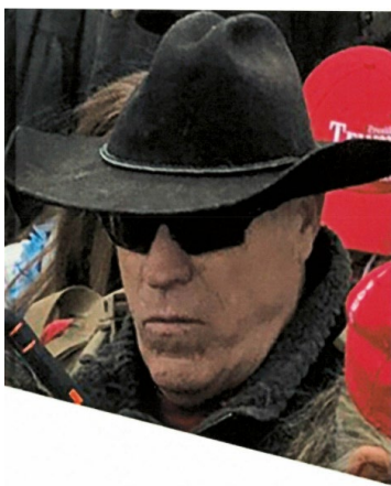
Still Image # 8