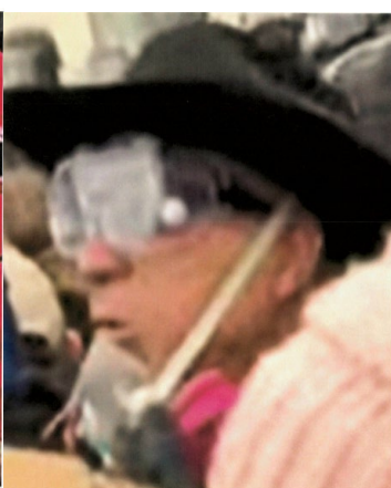
Still Image # 9