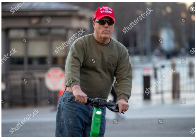
Still Image # 11

I observed a photograph on the website Shutterstock (Still Image # 11) of an individual who I believe to be HARRINGTON, with the following caption: “A supporter of US President Donald J. Trump rides a scooter near the White House in Washington, DC, USA, 11 December 2020. Supporters of US President Donald J. Trump are in town to participate in the second 'Million MAGA March' on 12 December to protest the results of the 2020 Presidential election.” 1