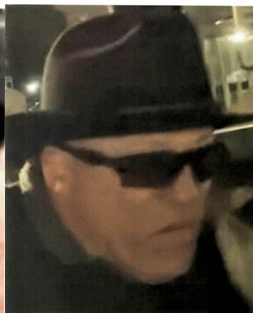
Still Image # 10