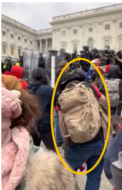
Still Image # 1

Following the events of January 6, 2021, the FBI Washington Field Office (WFO) identified an unknown subject in open-source videos from January 6, 2021, wearing a cowboy hat, goggles, a gas mask, and a backpack. (Still Image # 1 and # 2) The subject held a flagpole with a metal ball at the end and used the flagpole to hit law enforcement officers on Capitol grounds. (Still Image #3) The subject became designated by the FBI as BOLO 470-AFO (“BOLO” means Be On the Lookout), and the FBI asked the public for assistance identifying the individual.