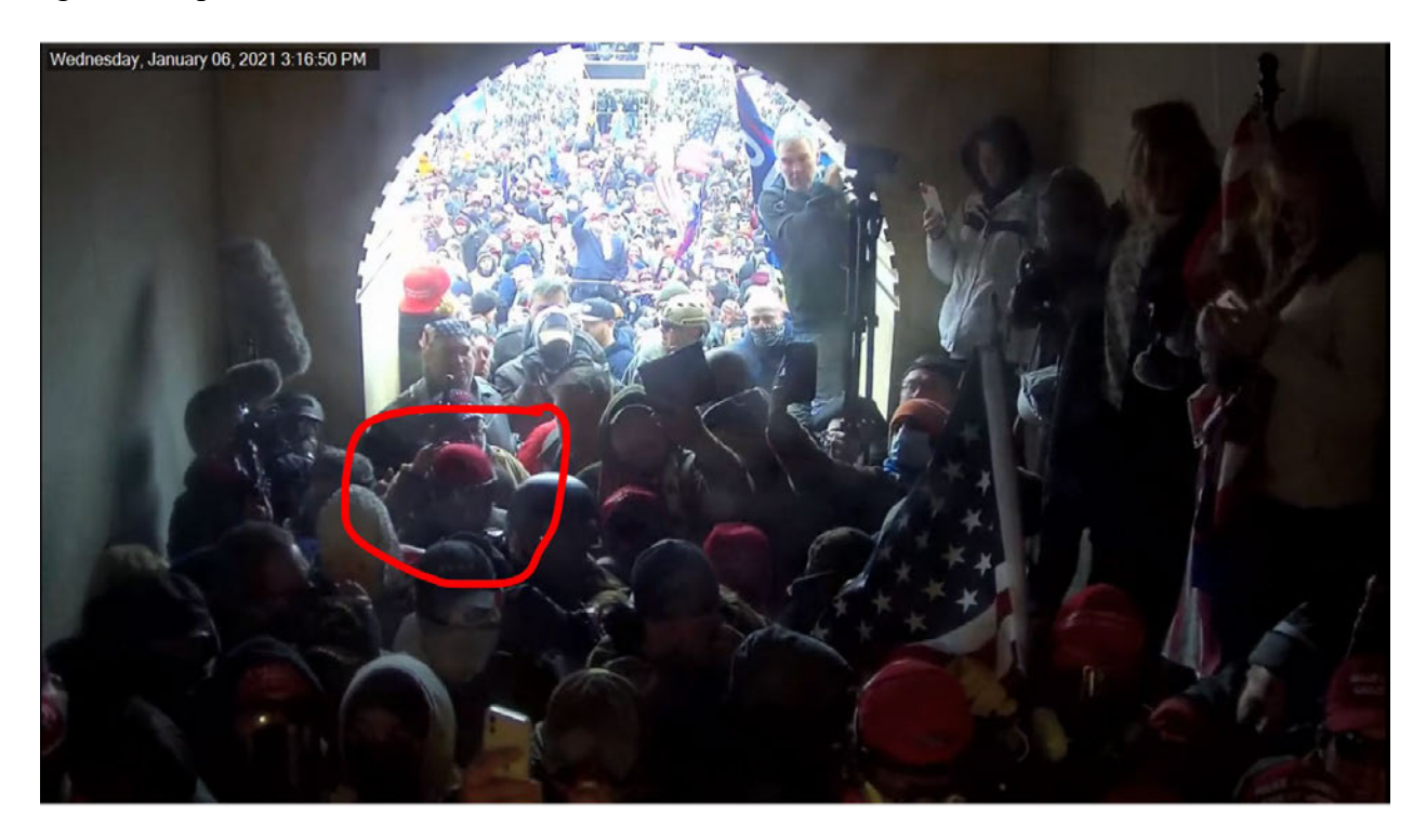
image from CCTV depicting AFO 235 pushing against other rioters as the crowd moved together against the police:

At approximately 3:19 p.m., the police successfully cleared the tunnel of rioters and pushed the rioters, including AFO 235, out of the tunnel and onto the LWT. AFO 235 remained at the police line for several seconds and clung to the edge of the tunnel entrance in an effort to resist the police push.