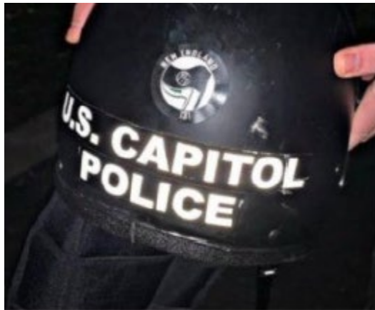
Image 1: Image from the online tip of what appears to be a Capitol Police Helmet with a New England 131 sticker affixed to it

On or about January 8, 2021, the FBI received an online tip that included a picture of what was believed to be a U.S. Capitol Police helmet defaced with a sticker affixed to the helmet. The helmet is black with U.S. Capitol Police lettering in white on the back side of the helmet. A small circular sticker with the words “New England 131” along with a black flag appears to have been placed on the helmet above the lettering: