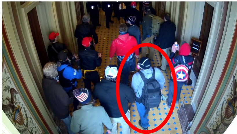
IMAGE 3: An image showing the Hall (circled in red) in the Capitol having just walked through the Parliamentarian Doors.

By reviewing CCV footage from the Capitol, your affiant observed Hall entering the Capitol building through the Parliamentarian Doors door at approximately 2:22 PM on January 6, 2021: