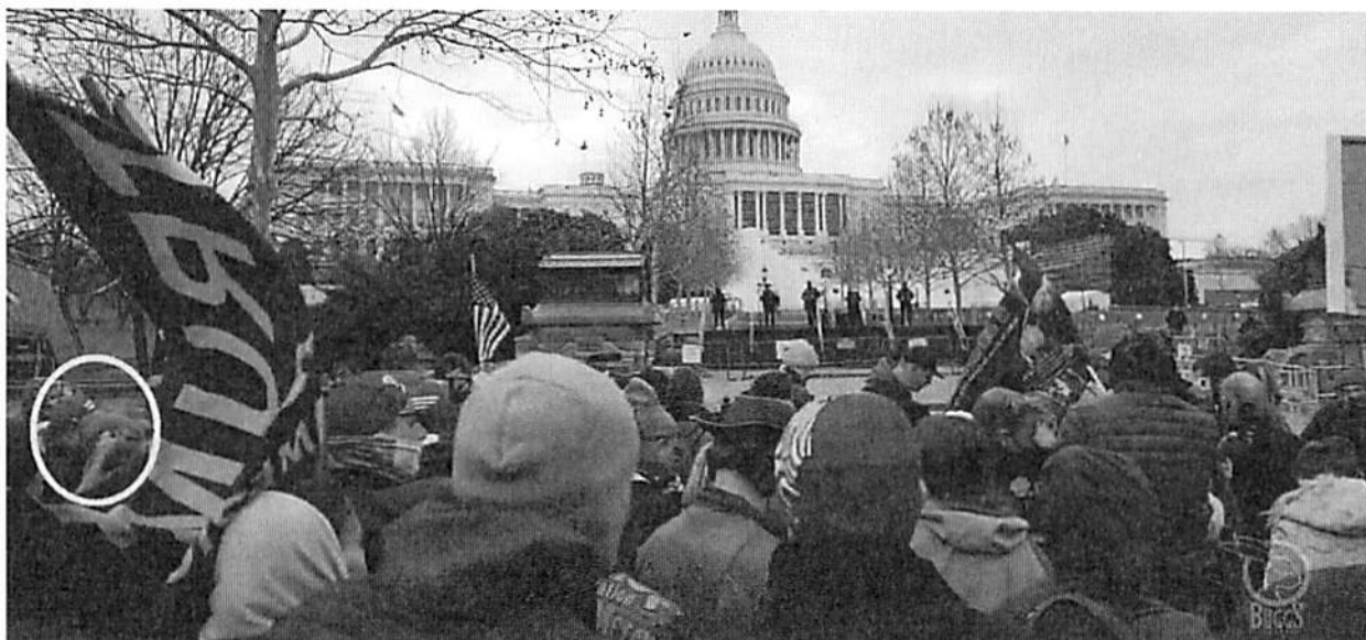
Figure 2: Rioters behind outer perimeter looking towards Capitol and interior perimeter. Co-defendant circled in yellow, Ms. Legros is not depicted but is present next to her co-defendant.

13. At approximately 12:50 p.m., Ms. Legros approaches the first line of bike racks surrounding the Restricted Area of the Capitol building. Along the line are signs that read, "AREA CLOSED." Immediately behind is another line of bike rack and a line of uniformed officers from the United States Capitol Police. See Figure 2.