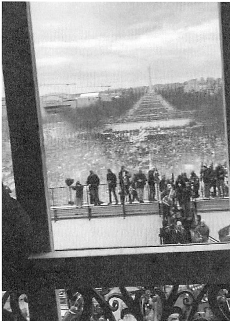
Figure 7: Still from a video file seized from Ms. Legros's phone.

23. Ms. Legros then moved to a balcony overlooking the West Front and exclaimed, “Oh my God, this is beautiful!” See Figure 7 .