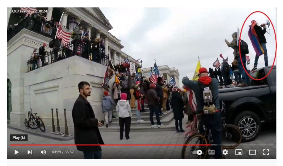
A Very Exciting Hour

A review of the "REEL: The Capitol Siege – January 6th – RAW FOOTAGE" YouTube video reveals CHRISTIE in possession of a claw hammer tucked into the belt loop of his pants. In the following two photos, the handle and claw of the hammer are visible as CHRISTIE extends his arms and torso upward.