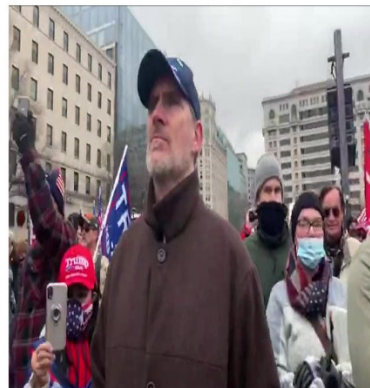
2021 Freedom Plaza