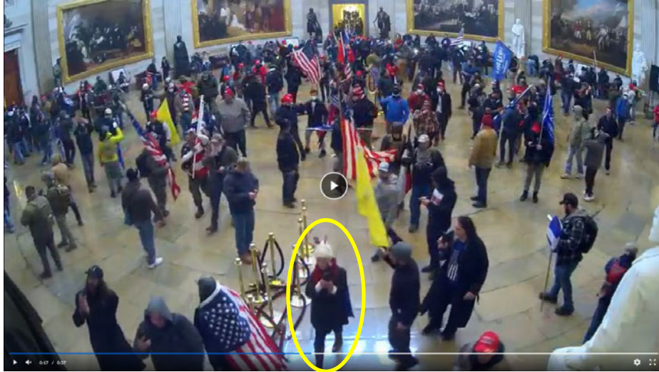
She briefly left the Rotunda for a few minutes, returning at 2:50 p.m.: