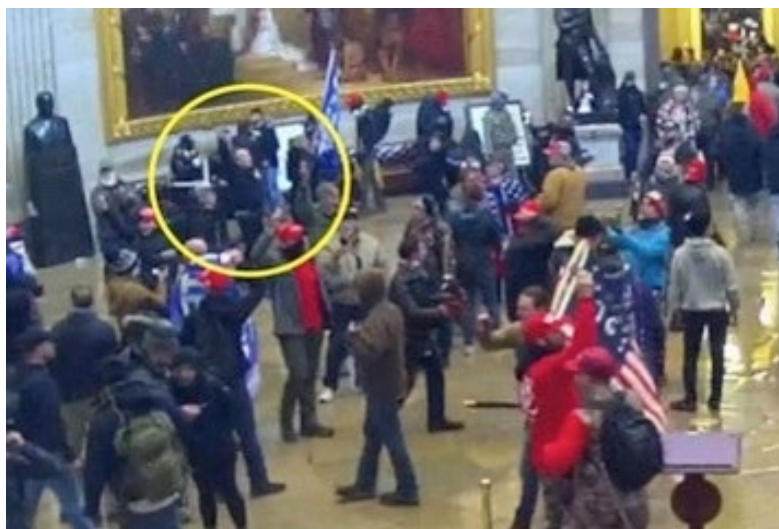
Timestamp approximately 19:41:17