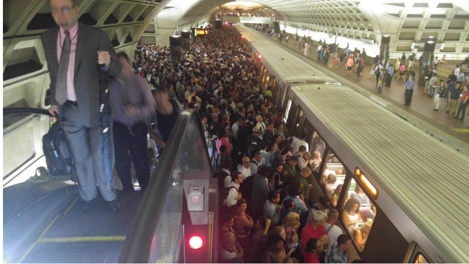
Figure B, Metrorail Photograph 5

As anyone who has taken the Metro at busy times knows, the density of ridership and the impatience of riders often results in jostling. Defs.' SOF at 5, ¶¶ 8, 9. Passengers often run on the escalators or push through packed crowds on platforms to board trains. Id. Riding the train might mean standing so close to other riders that their breath can be felt on one's neck, or their coat might rest on one's head. Id. Because Metro doors cannot effectively be held open once they begin to close, passengers riding in the middle of a packed train car often must ramrod through other riders to disembark before the doors close. Id. Passengers riding late at night, or after sporting or special events, may be drunken and rambunctious. Defs.' SOF at 6, ¶ 25.