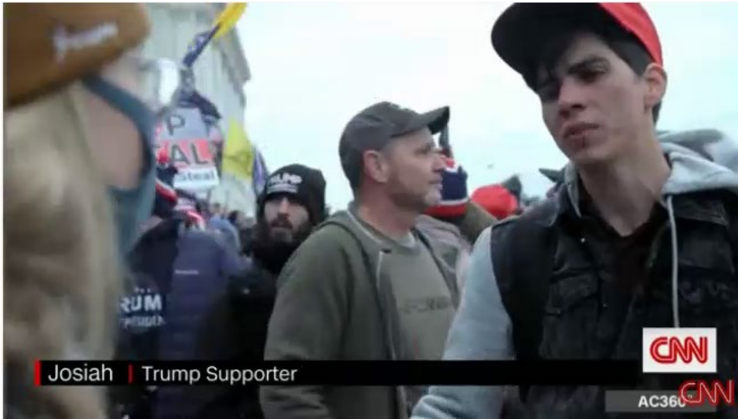
Image 6 (from Exhibit 2 at approximately 2:50): Hueso speaking to CNN