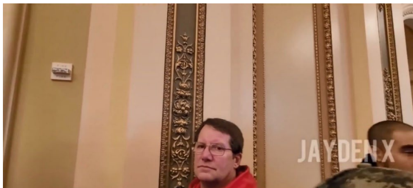
(Figure 1: Frame captured from Jayden X video, clip time 27:49, approximately 2:38 p.m.)

On or about January 7, 2021, an individual posted a video titled “The Insurrection of The United States Capitol” to YouTube under the username Jayden X. The video, which is no longer available on YouTube, 1 depicts, among other things, a large crowd climbing stairs leading to the Upper West Terrace of the U.S. Capitol, individuals entering the Capitol building through the Senate Wing Doors, and crowds walking through the Capitol hallways. The video captures several clashes between individuals and law enforcement, including the fatal shooting of Ashli Babbitt outside the Speaker’s Lobby, adjacent to the House chambers. In the minutes leading up to this shooting, the video shows rioters attempting to breach the door to the House Chamber. The camera then pans to individuals standing in the hallway just outside the House Chamber and captures an individual wearing glasses and a red hooded sweatshirt at approximately 27:49. (Figure 1).