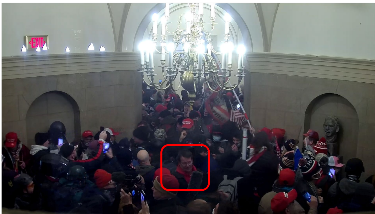
(Figure 6: CCTV of Memorial Door)