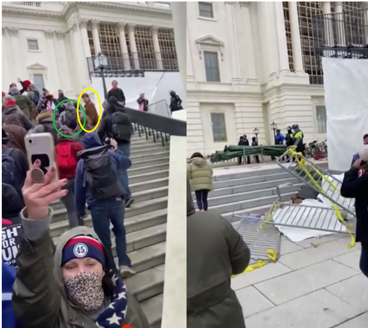
Images 3 and 4. Exhibits 10a and 10b, screenshots from Exhibit 10 at 0:15 and 0:30.

When the Cantrells reached the Upper West Terrace, they observed broken police barriers. The following two images come from a single video recorded by a rioter following the Cantrells up to the Upper West Terrace.