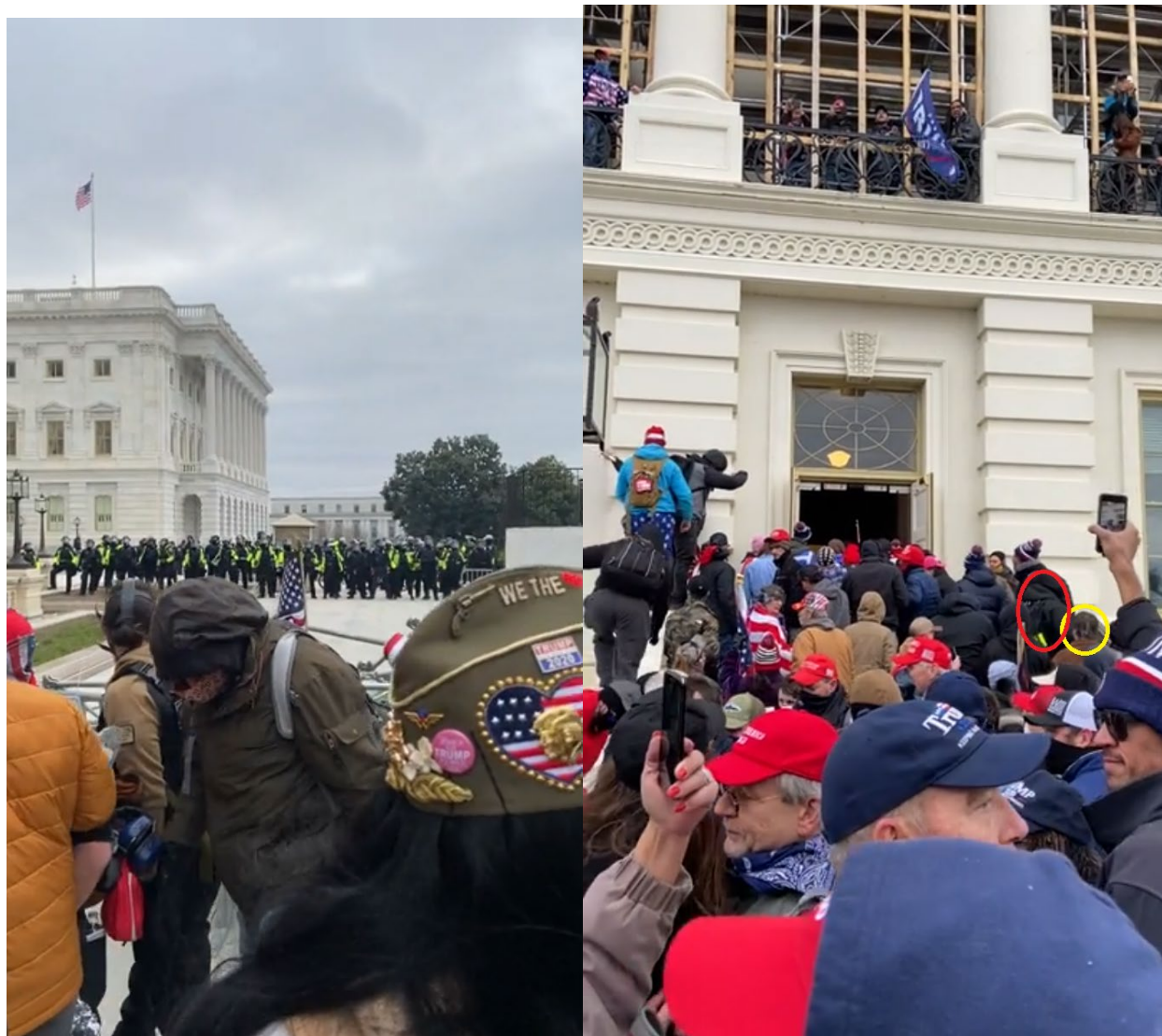
Images 6 and 7. Exhibits 15a and 15b, screenshots from Exhibit 15 at 0:58 and 1:15.

The Cantrells moved south on the Upper West Terrace, past the broken police barriers identified in Image 4. Their path was blocked by a makeshift barricade, beyond which was a line of police officers in riot gear. A video from a rioter shows the barricade, police, and then pans to the left to show the Cantrells ascending the stairs toward the Upper West Terrace door (the “UWT door”) where they entered the Capitol building.