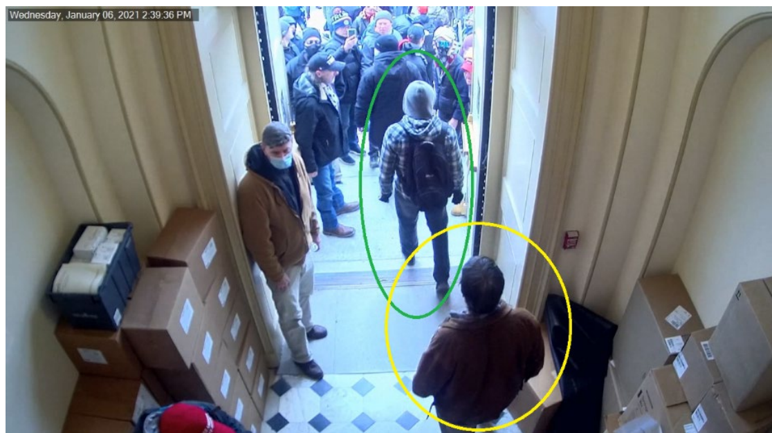
Images 14 and 15. Exhibits 18d and 17c, screenshots from Exhibits 18 at 19:31 and 17 at 19:36.