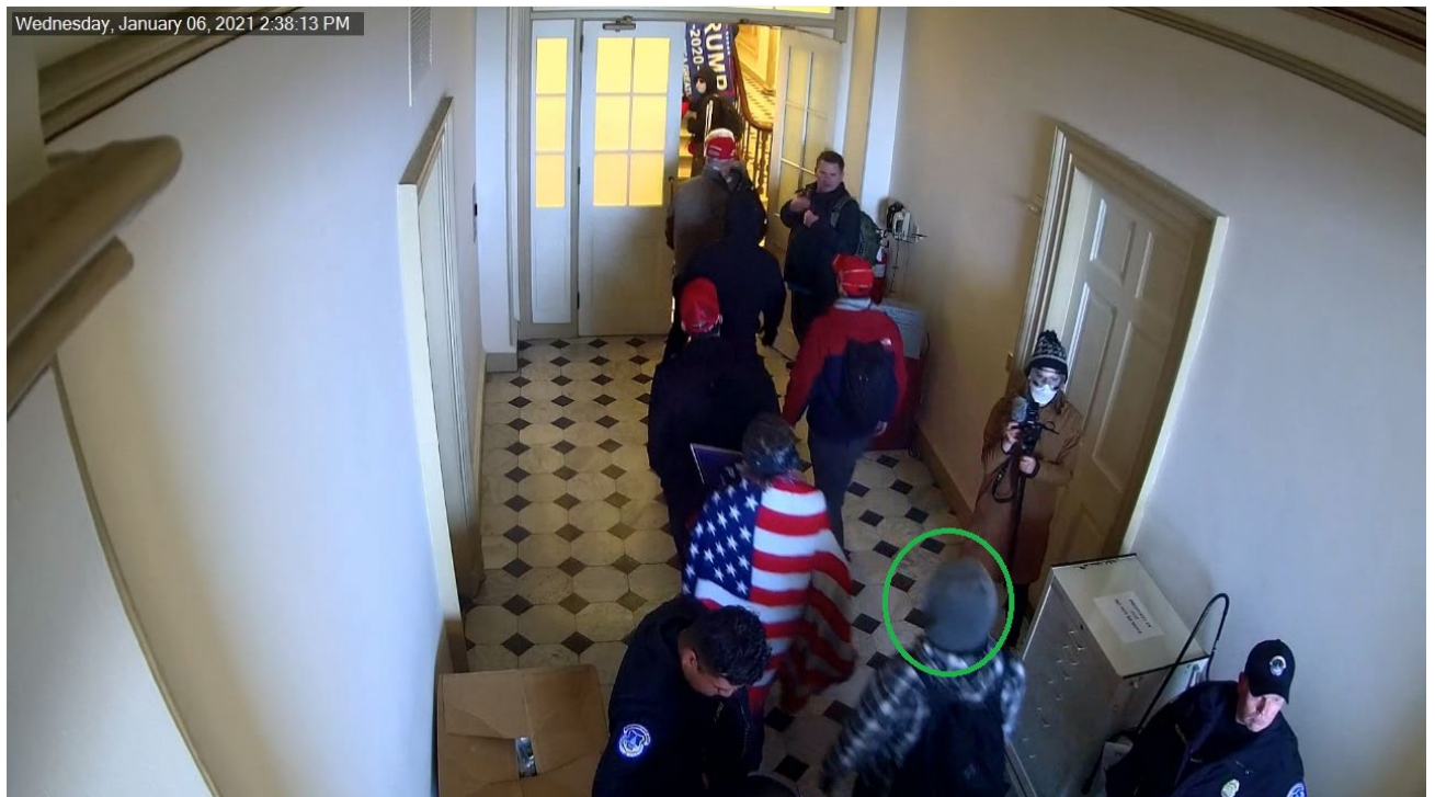
Images 12 and 13. Exhibits 18b and 18c, screenshots from Exhibit 18 at 17:59 and 18:13.