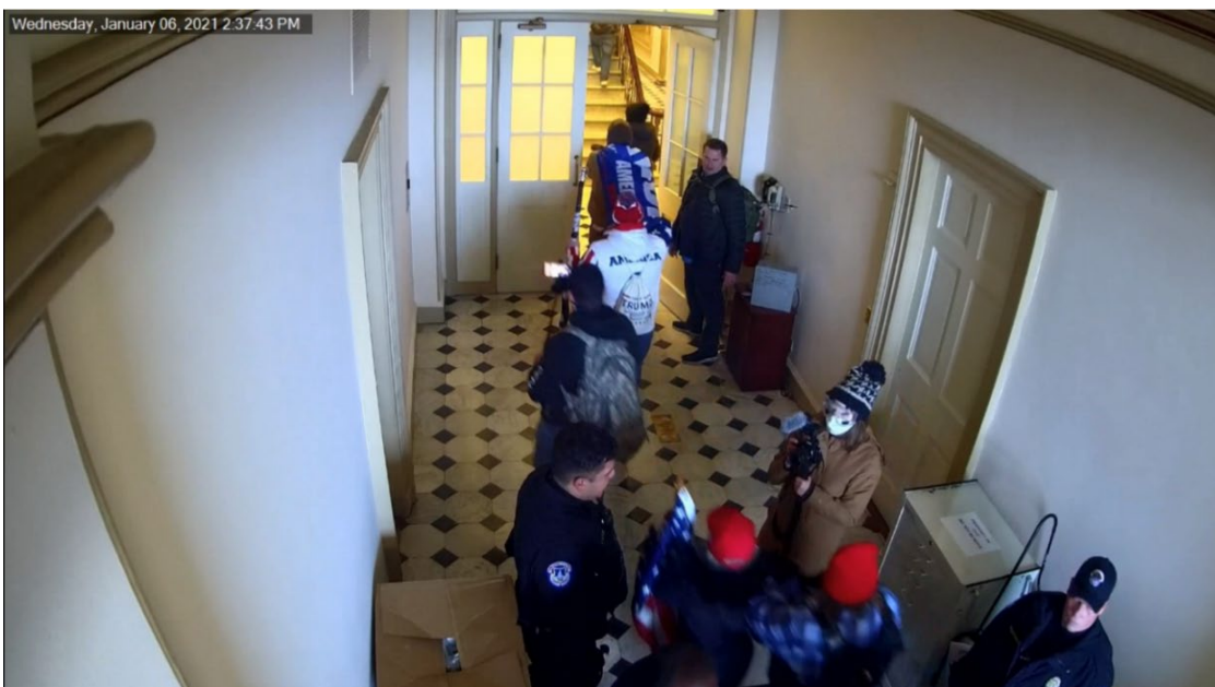
Images 8 and 9. Exhibits 16a and 18a, screenshots from Exhibits 16 at 0:18 and 18 at 17:43.