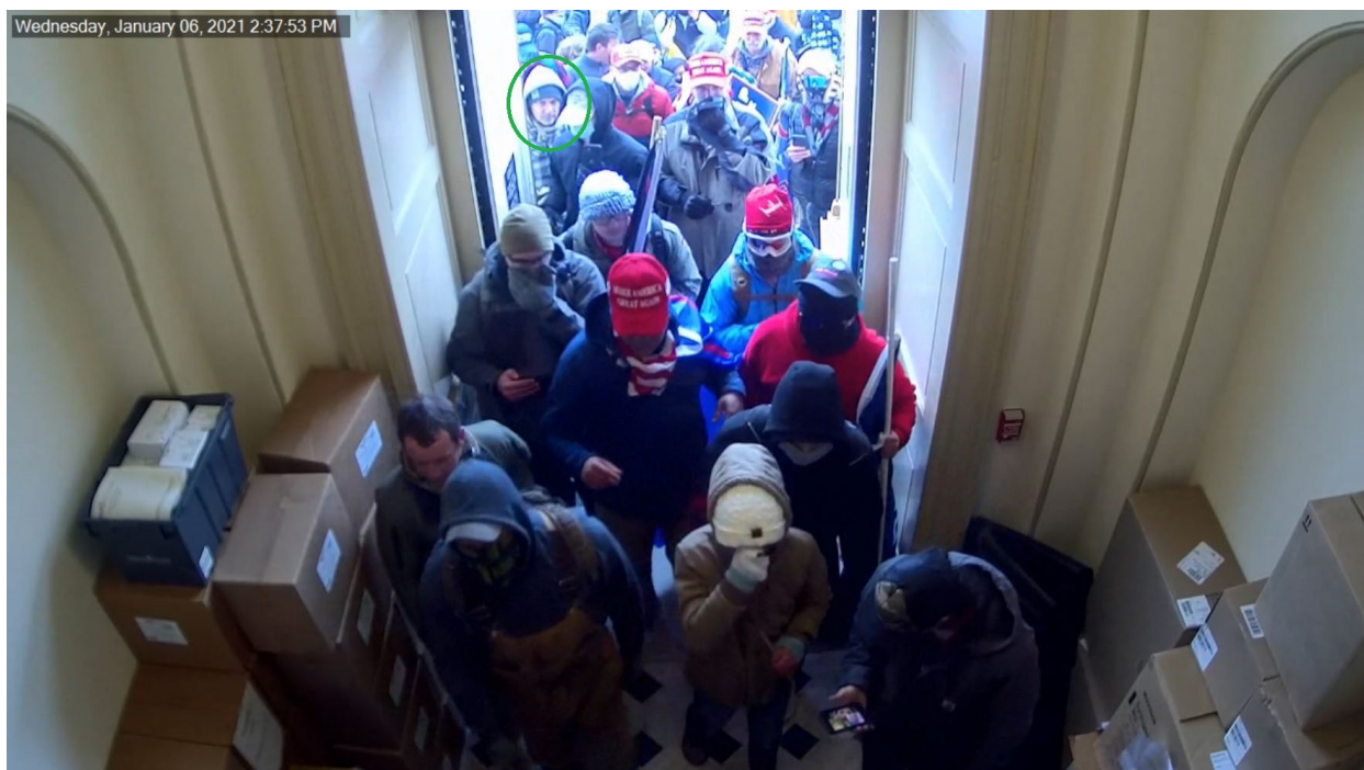
Images 10 and 11. Exhibits 17a and 17b, screenshots from Exhibit 17 at 17:44 and 17:53.