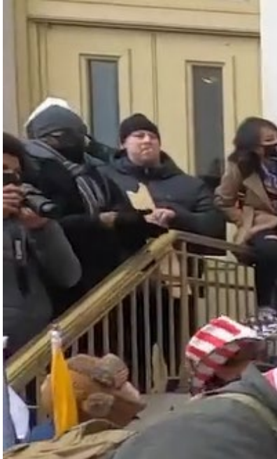
(Outside of the Parliamentarian Doors)