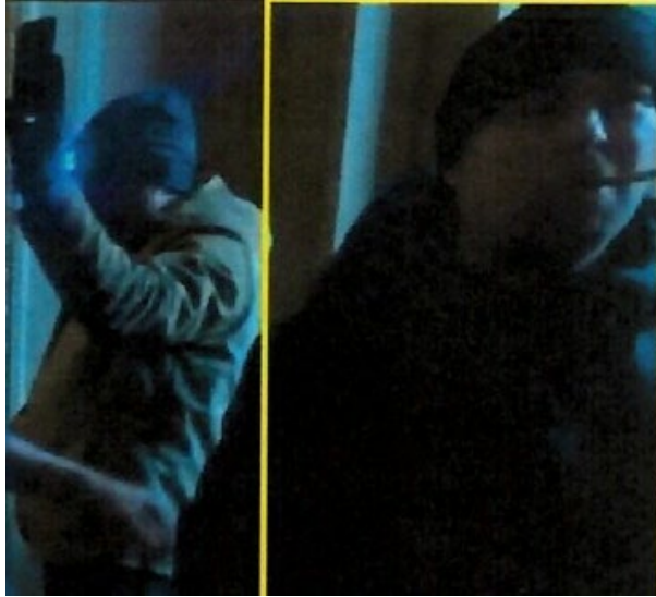
(Inside of the U.S. Capitol)