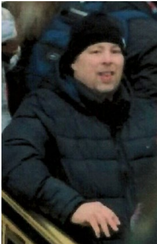
(Outside of the U.S. Capitol)