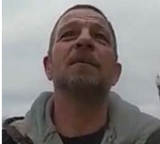
Image 17- cropped version of Image 3 – Screenshot of AFO-324 from D.C. Metropolitan Police Posting