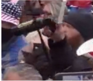
Screenshots from Resistance Video