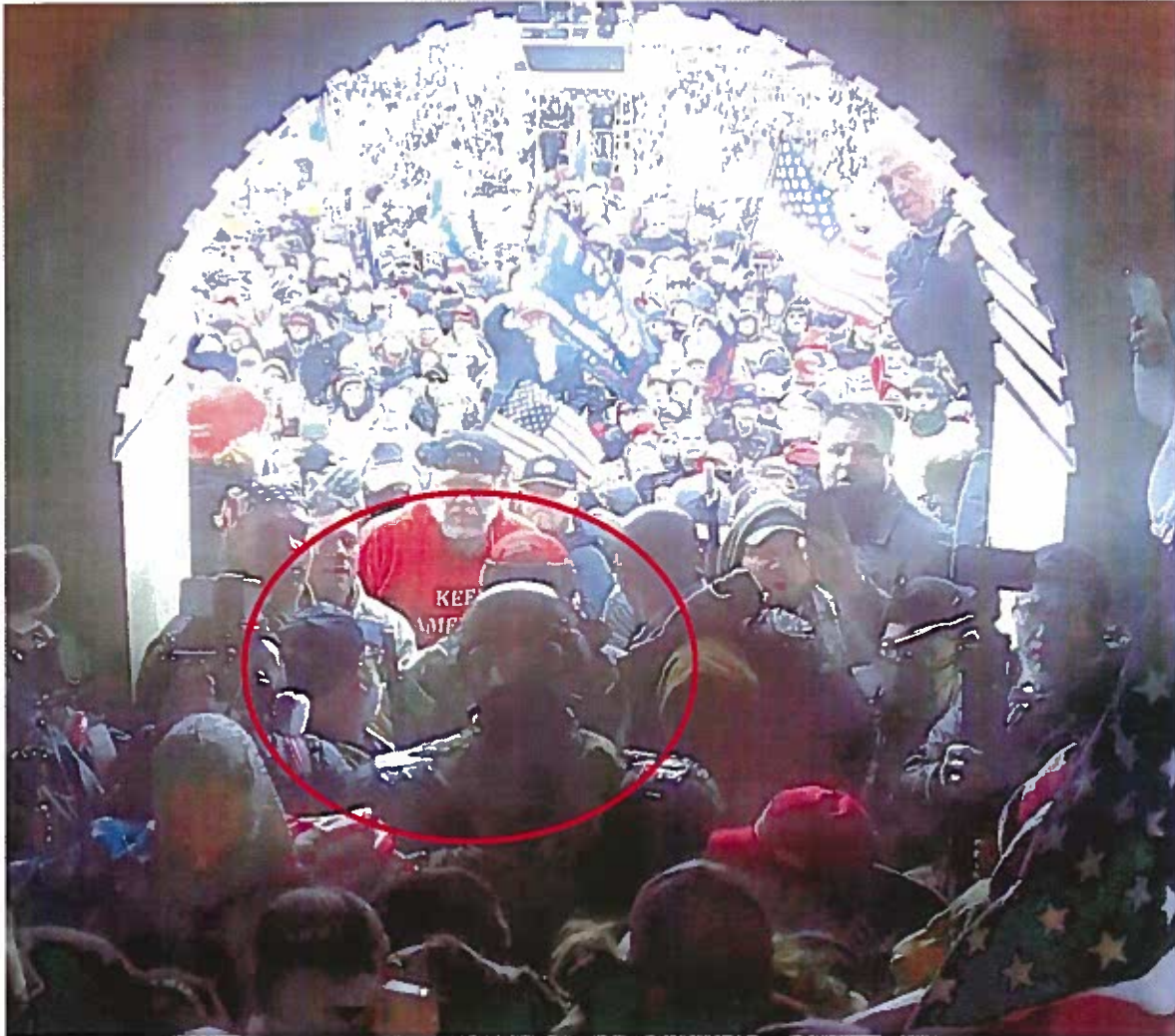
Images of the video showing MAZZA pushing with the group yelling "heave-ho" while armed with a baton include the following: