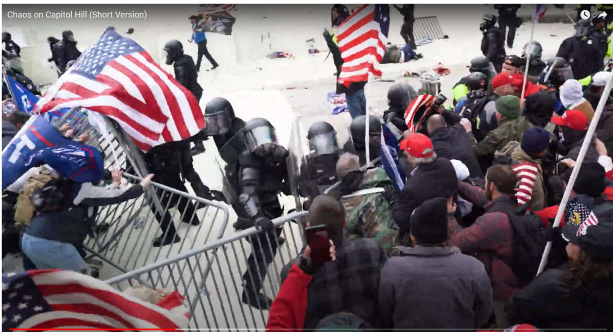
Figure 6: Seconds later, the police line collapsed. Mault and Mattice are to the right, out of frame.