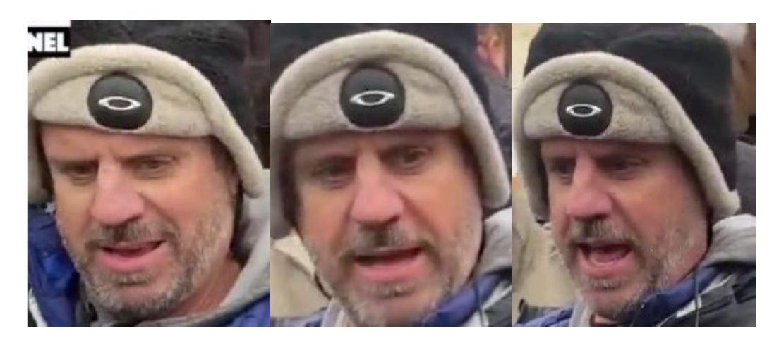
(Additional photographs of BOLO172-AFO at the US Capitol on January 6, 2021)

(FBI Seeking Information Poster for BOLO164-AFO through BOLO173-AFO)