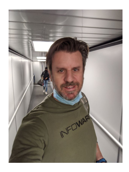
(Picture posted by "JB" in Telegram Group "The California Patriots- DC Brigade")

One of the members of this chat was Telegram user "JB" (UID XXXXXX1832). On January 5, 2021, at approximately 6:30 a.m. PST, Telegram user "JB" posted a picture of himself with the caption "Boarding LAX." LAX is the airport code for the Los Angeles International Airport.