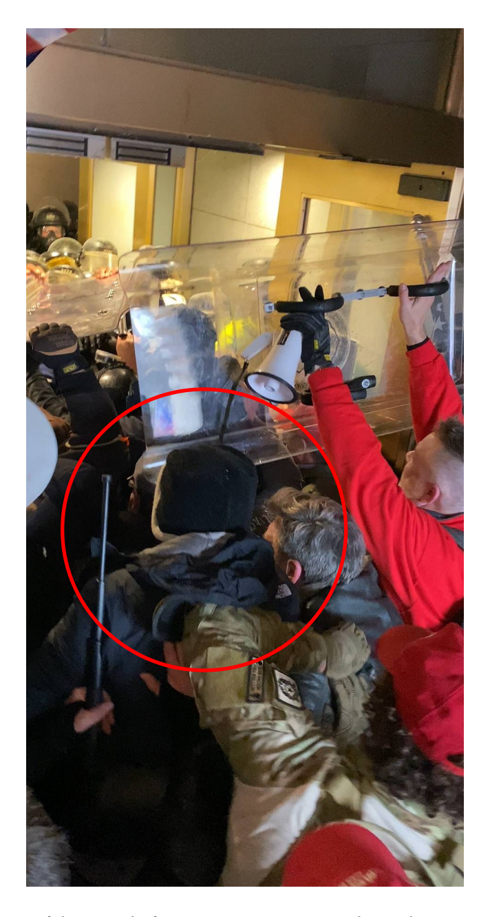
(BROWN at the front of the crowd of rioters participating in the pushing action against officers)